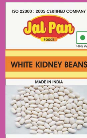
WHITE KIDNEY BEANS