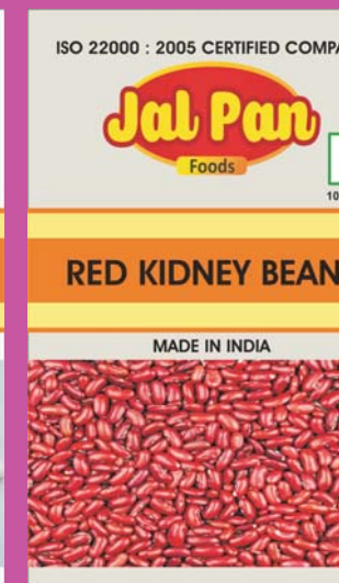
RED KIDNEY BEANS