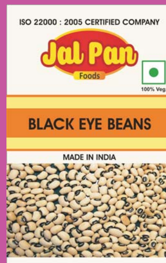
BLACK EYE BEANS