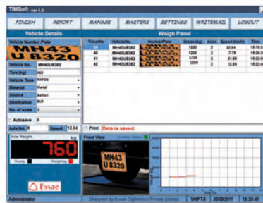
Cloud based interface and software.

The Proprietary software ensures fully automatic weighing. Advanced functions like the Vehicle configuration and classification, law compliance checking, fines computing, or LEF calculations are implemented without any additional costs for the user.