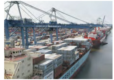
TWIM Adding efficiency at seaport

Essae TWIM system provides the ability to weigh thousands of containers prior to loading onto ships without the delays caused by trucks stopping at static scales.