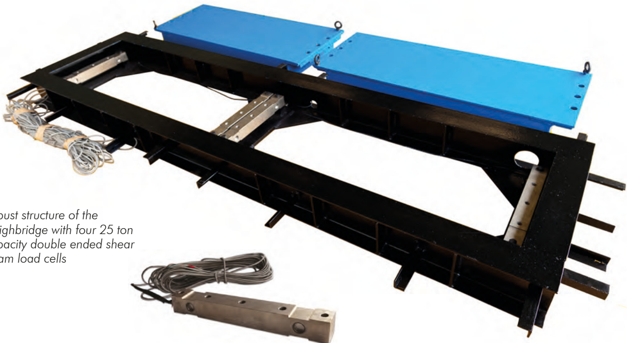
Robust structure of the weighbridge with four 25 ton capacity double ended shear beam load cells