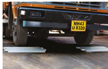
Portable Weigh Pads