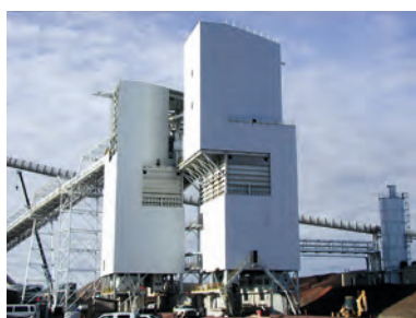
Rapid Loadout System