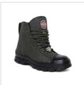
Jungle Safety Boot Shoes