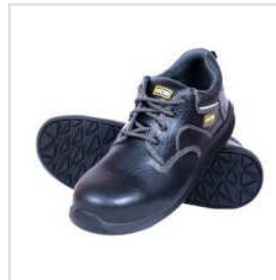
Safety Stylish Shoes