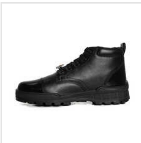
Sherrif Black PU Direct Injection Safety Shoes