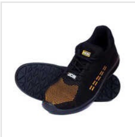
Light Weight Safety Shoes