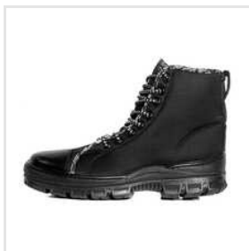
Black Anti Skid Safety Shoes