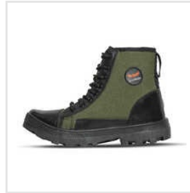
Cushioning Effect Safety Shoes