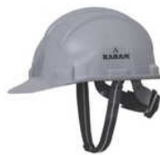
GREY SAFETY HELMET