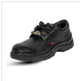
Oil And Acid Resistant Safety Shoes