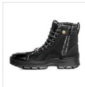
Black Zip Odour Free Safety Shoes