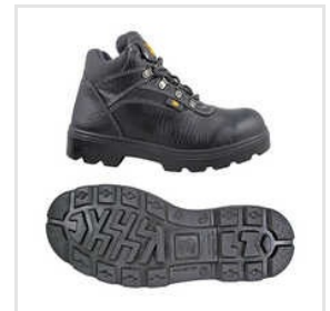
Gents Ankle Safety Shoe