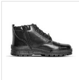
Sherrif Black Zip Extra Gripping Safety Shoes