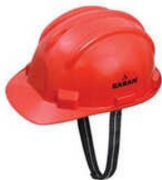
RED SAFETY HELMET

Abrasion Resistant Safety Shoes, Abrasion Resistant Safety Shoes, Anti Skid Safety Shoes, Anti Skid Sports Shoes, Black Anti Skid Safety Shoes, Black Zip Odour Free Safety Shoes, Breathable Fabric Safety Shoes, Collar Boot Hillson Safety Shoes, Cops Black Color Safety Shoes, Cops Tan Color Safety Shoes, Cushioning Effect Safety Shoes, Extra Gripping Safety Shoes, Extra Gripping Tan Color Sports Shoes, Gents Ankle Safety Shoe, Grey Safety helmet, etc.