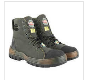
Collar Boot Hillson Safety Shoes