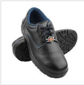
Light Weight Safety Shoes