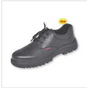
Workers Safety Shoes