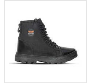
High Ankle Anti Skid Safety Shoes