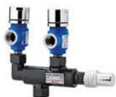
Ammonia Dual Safety Valve