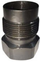
Industrial Internal Safety Valve