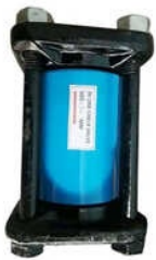
Inline Check Valve