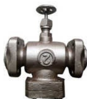
AMMONIA SCREWED GLOBE VALVE