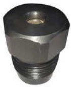
Internal Safety Valve