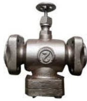
Ammonia Screwed Globe Valve