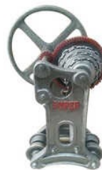
Ice Machine Hand Hoist Machine