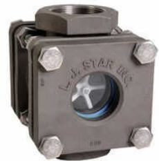
Sight Flow Indicator