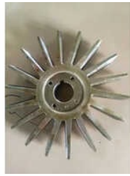
Submersible Pump Impeller