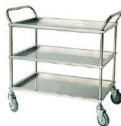
SS Instrument Trolley