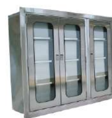
Lab Wall Cabinet