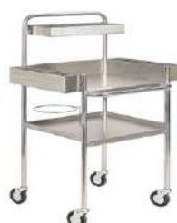
Operation Theater Trolley