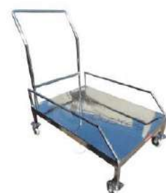
SS Material Trolley