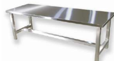
SS Sitting Table