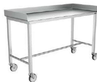
Clean Room Table