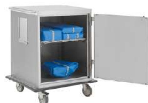
SS Cabinet Case