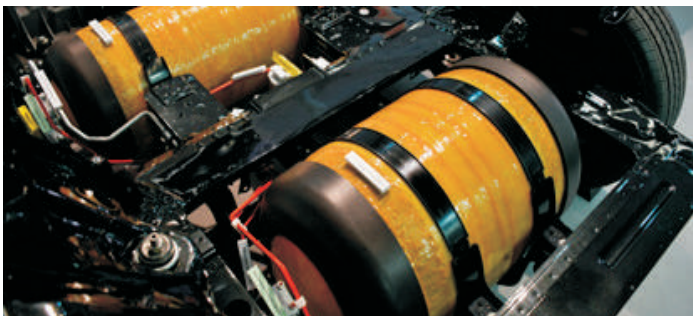
Fuel cell industries