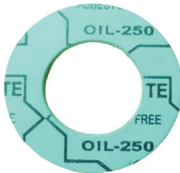
SUPERLITE OIL-250 Oil Resistant