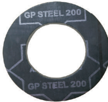
SUPERLITE GP-200 STEEL Low Pressure with wire