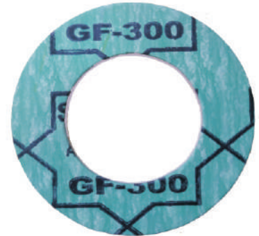
SUPERLITE GF-300 High Pressure