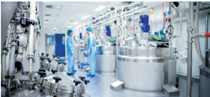
Food & Pharmaceuticals