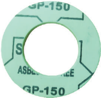
SUPERLITE GP-150 Low Pressure