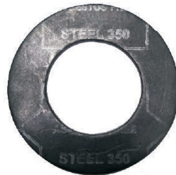
SUPERLITE OIL -350 STEEL High Pressure with Wire