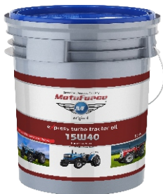
CH - 4 Tractor Oil