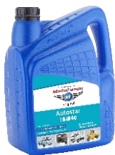
CF - 4