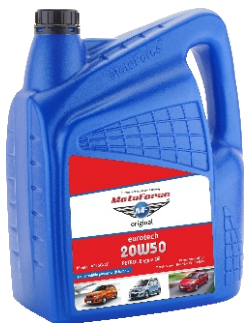
Meet API - SG/CF