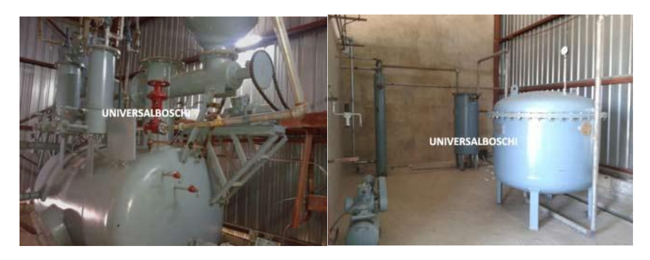
UA – 25 Acetylene Generator