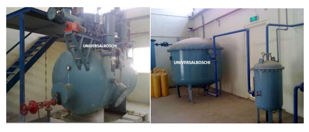
UA 50 m3/hr Acetylene Generator