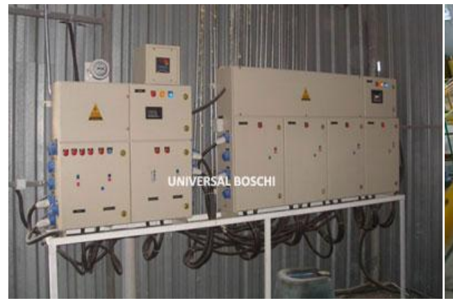
UA-200 Filling Compressor Push Button Switch