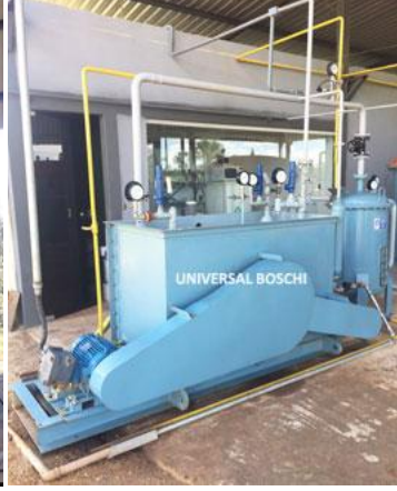
UA-50 Acetylene compressor