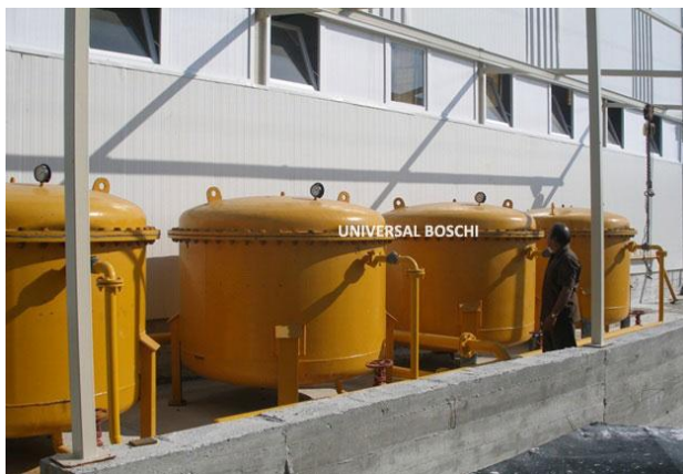
UA 200 m3/hr Acetylene Installation with UNIVERSAL Engineer