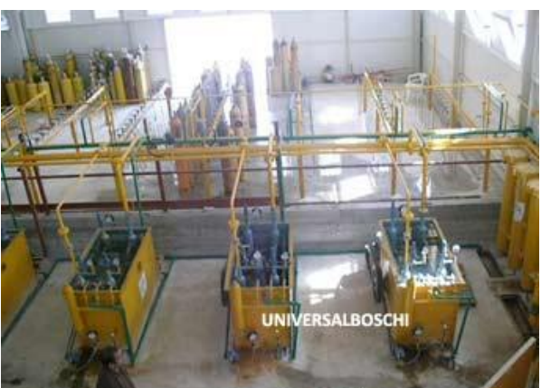
Top View of UA 200 filling System