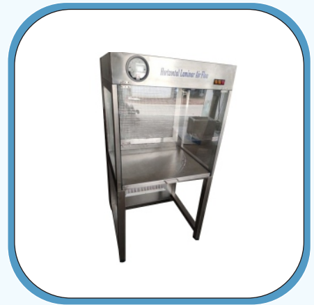
Horizontal Laminar Air Flow