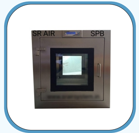
Static Pass Box