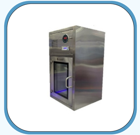
Industrial Dynamic Pass Box