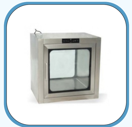
Stainless Steel Static Pass Box