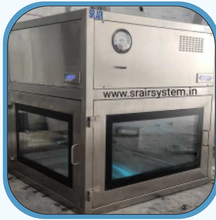
Dynamic Pass Box