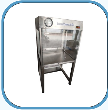
Horizontal Laminar Air Flow