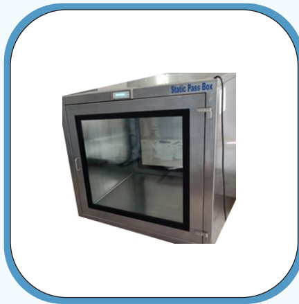
Industrial Static Pass Box