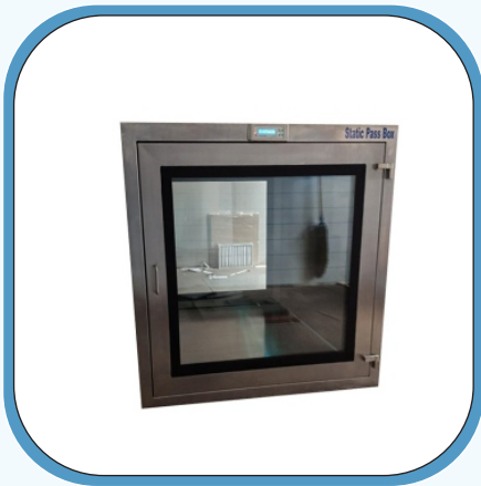
SS Static Pass Box