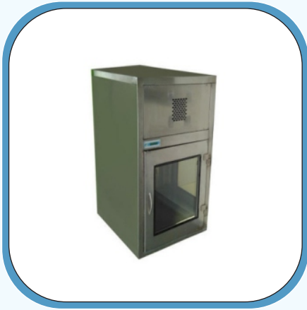
Dynamic Static Pass Box