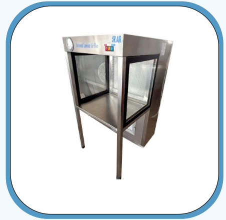
Stainless Steel Horizontal Laminar Air Flow