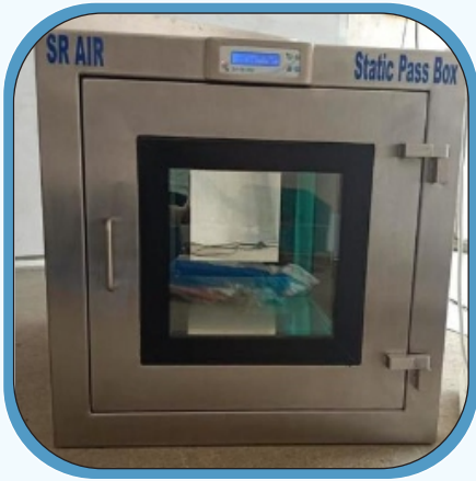
Stainless Steel Static Hatch Box