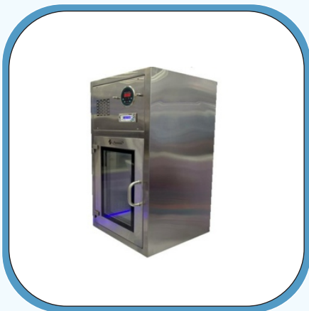
SS Dynamic Pass Box