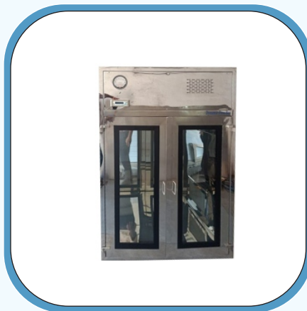
Double Door Dynamic Pass Box