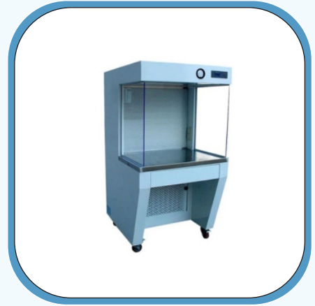
Laminar Air Flow Bench (Vertical-Horizontal)