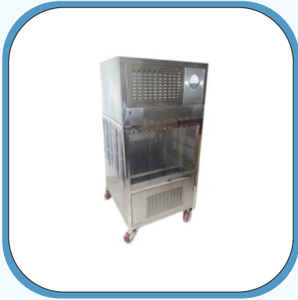
Mobile Laminar Air Flow