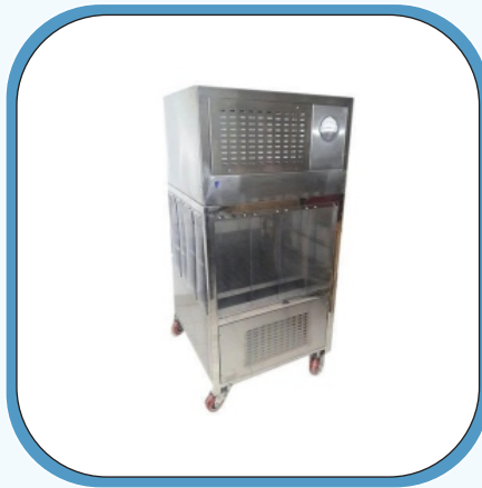
Mobile Laminar Air Flow