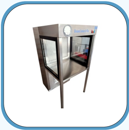
Stainless Steel Horizontal Laminar Air Flow