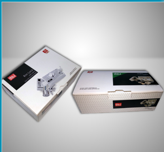
UV COATED BOXES