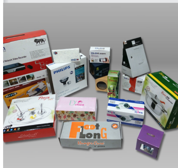
MULTICOLOUR CORTONS BOXES