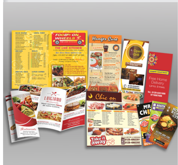
TABLE MENU / TAKE AWAY MENU