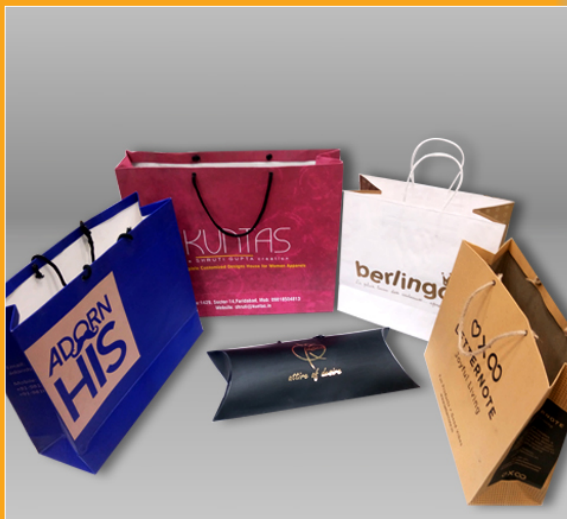
PAPER CARRY BAG