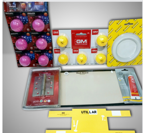
BLISTER PACKAGING CARD