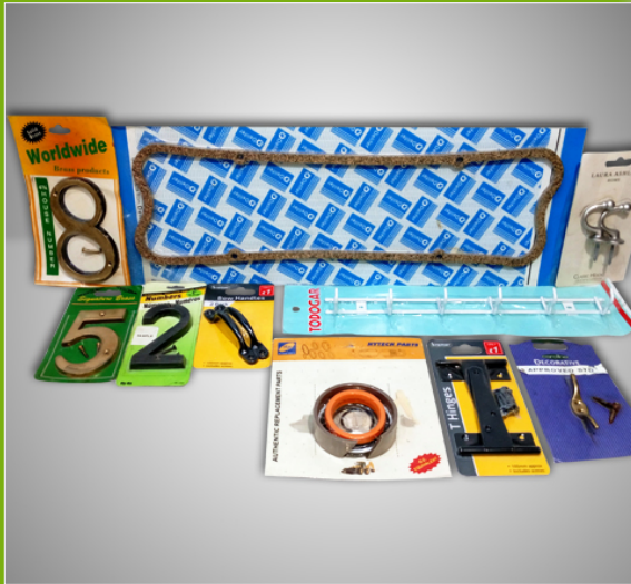
SKIN PACKING CARDS