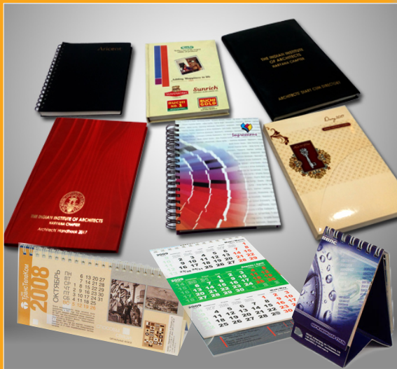
DIARY AND CALENDAR