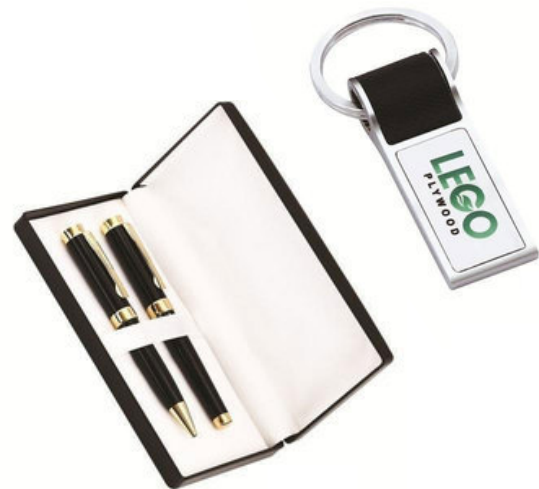
PEN , KEY RING