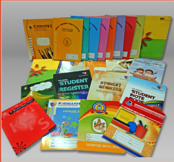
EXERCISE NOTE BOOK