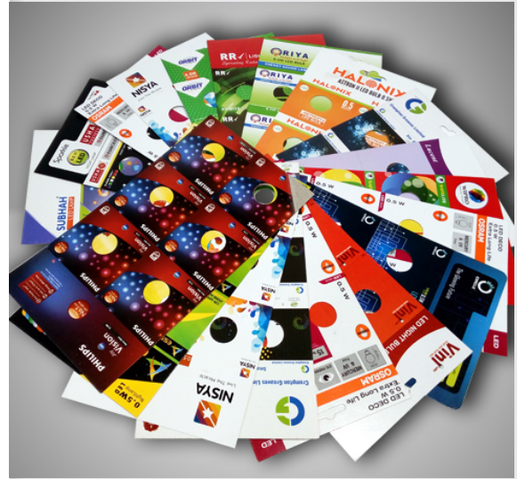
BLISTER PACKAGING CARD