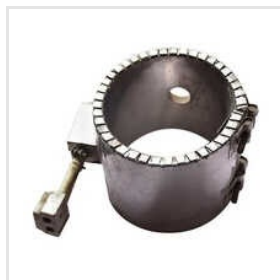
Chemical Air Heater