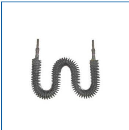
FINNED TUBULAR HEATER

230 Volt Tank Heater, 280V Porcelain Heater, 30W Soldering Pot, 380 V Muffle Furnace, 5mm Industrial Thermocouple, 75W Temperature Control Soldering Station, BTH Tank Heater, Cartridge Heater, Chemical Air Heater, Dip Soldering Pot, Electric Furnace Heating Element, Electric K Type Thermocouple, Finned Tubular Heater, Heating Coils And Tubes, High Density Cartridge Heater, etc.