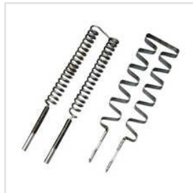
Metallic Heating Element