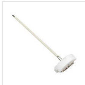
K Type Furnace Thermocouple