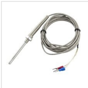
5mm Industrial Thermocouple