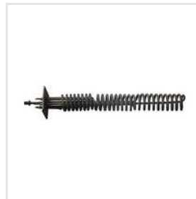
Electric Furnace Heating Element