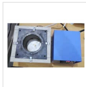
S300 Soldering Pot