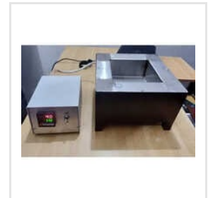
Dip Soldering Pot