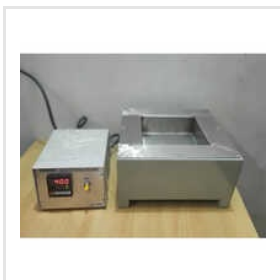
30W Soldering Pot