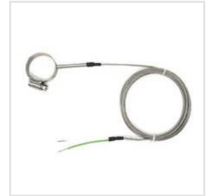
J Type Thermocouple