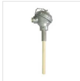
R Type Furnace Temperature