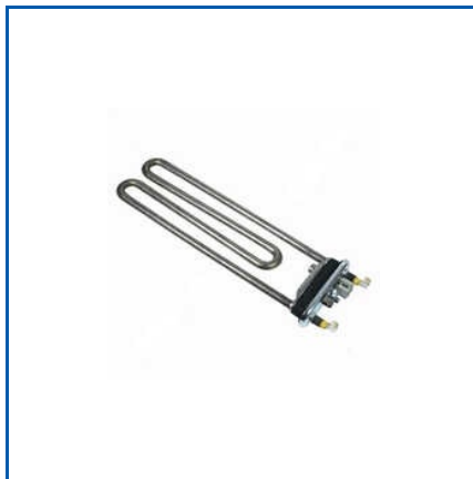
WASHING MACHINE WATER HEATER HIGH DENSITY CARTRIDGE HEATER