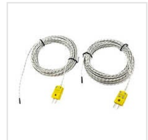
Electric K Type Thermocouple