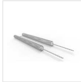
Heating Coils And Tubes