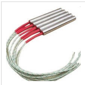
High Density Cartridge Heating Element