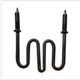
M Type Tubular Heater