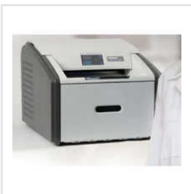
Refurbished Carestream CR Printer