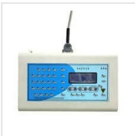
GME 250MA HF X Ray Machine