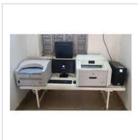
Regius Sigma II CR System