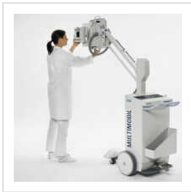
Refurbished Siemens X Ray Machine