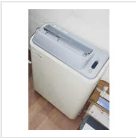
Fuji Prima Capsula CR System