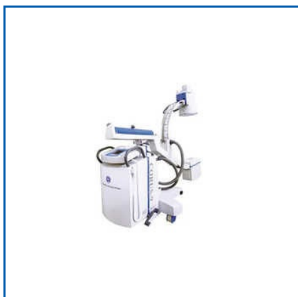
CORUS 9 DIGITAL C ARM X-RAY MACHINE

10 Ma Portable X Ray Machine, 100 Ma Fixed X Ray Machine, 100Ma X Ray Tube Head, 10MA Portable X Ray Machine, 12 Channel ECG Machine, 3 Para Patient Monitor, 300MA X Ray Machine, 30mA Portable X Ray, 50mA Portable X-Ray Machine, 8 kW Portable High Frequency mobile X Ray Machine, 8kw Portable High Frequency mobile X Ray Machine, Agfa 12x CR Machine, Agfa 12x CR System, Agfa 30X Cr System, Alerio 4kW Maestro 4000 Fixed X-Ray Machine, etc.