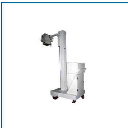
GME COUNTER BALANCE X RAY MACHINE