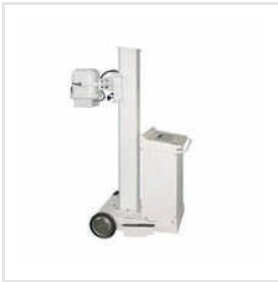
Refurbished RMS X Ray Machine