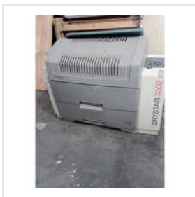
Refurbished Cr System