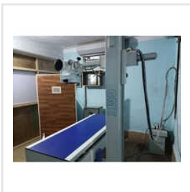
300MA X Ray Machine