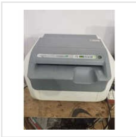
Fujifilm Prima T2 Cr Machine