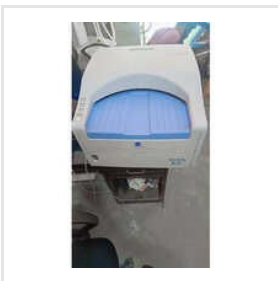
Refurbished Konica Cr