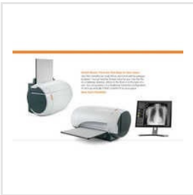
Carestream Vita Flex Cr System