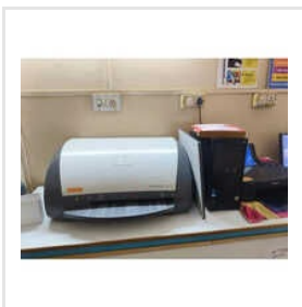
Carestream CR System