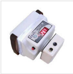
10MA Portable X Ray Machine