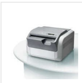
Refurbished Fujifilm FCR T Prima CR System