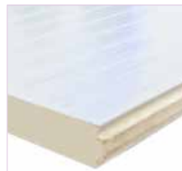
Galvanized Sheet (Available in 0.8/1.0/1.2/1.5 mm)