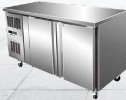
CGN 2100 C / EGN 2100 C/F UC 1501 C / UC 1502 C