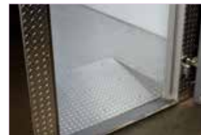
Internal Ramp (used where sunken flooring not available)