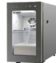
BR9CN (Available in solid door)