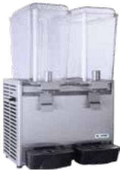
JD LP 8x2