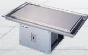
E3F Frost Top