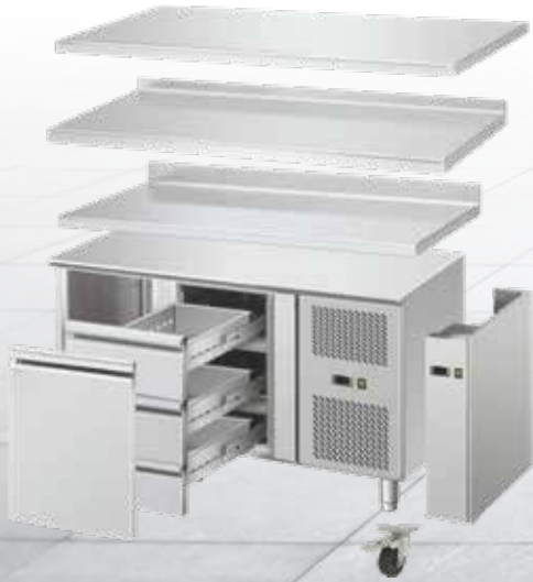
Choice of Top & Drawers

Elanpro Professional Reach-ins and Under Counters for refrigeration or freezer application are designed to meet the tough Indian kitchen conditions. Our Reach-in chillers and freezers present a host of exciting new features and are tested to perform in the ambient environment of 43°C and 38°C respectively.