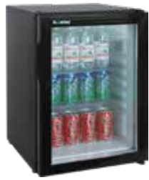
RB 41 G

Elanpro Minibars are designed keeping in mind the room aesthetics and noiseless cooling performance for your discerning guest.