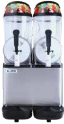
FB X 224