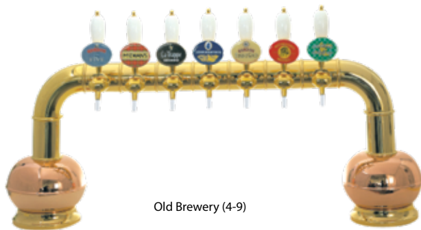
Old Brewery (4-9)

Elanpro is known for its pioneer presence in Draft beer solutions with the most innovative range of Towers in Brass, Copper, SS, Raisin and Ceramic finish with illuminated and non-illuminated branding options. The cooling solution starts from a single line up to 16 lines to meet any type of beer installation requirements. With over 5000+ installations in the country, Elanpro today has a dominating presence in the Draft beer segment.