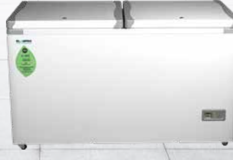
EF 335 DD