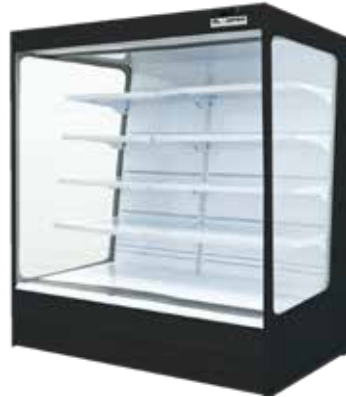
Remote Multi Deck RF 188 / 250 / 375