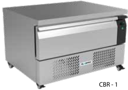
CBR - 1

Elanpro Flex drawer are designed to save space and enhance user experience. The unique convertible feature helps in converting freezer to fridge and vice versa.