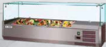
EVRX 1200 / EVRX 1400