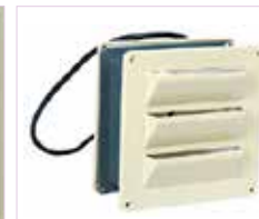
Pressor Relief Port