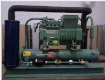
Bitzer Air/Water Cooled Unit