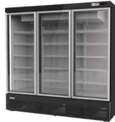
Plug-in Multi Door - Freezer & Chiller SL2D 131 / SL3D 197 / SL3D 210 SM2D 123 / SM3D 183 / SM4D 245