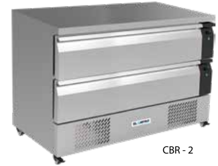
CBR - 2

Manufactured as per European Technology and Standards. GN pans are optional.