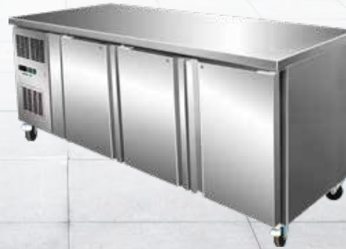
CGN 3100 C / EGN 3100 C/F UC 1801 C / UC 1802 C