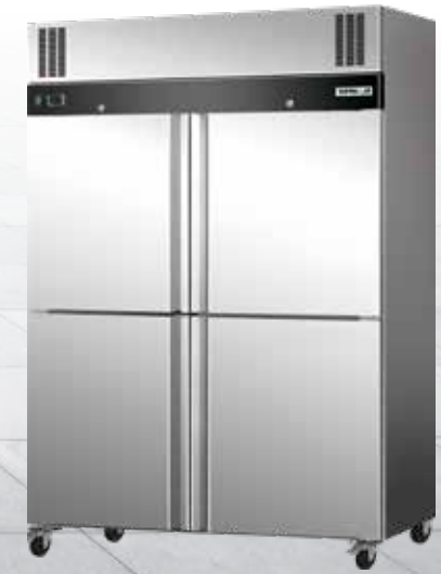
CGN 1200 C4/F4 EGN 1410 C4/F4 CGN 1200 CF RI 1101 C4/F4