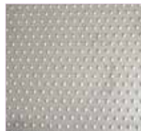
1.2 mm Dimple Plates embedded in floor pan