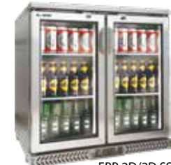
EBB 2D/2D SS