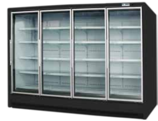
Remote Multi Door - Freezer & Chiller RL2D 156 / RL3D 234 / RL4D 312 / RL5D 390 RL2D 123 / RL3D 183 / RL4D 245 RM2D 123 / RM3D 183 / RM4D 245