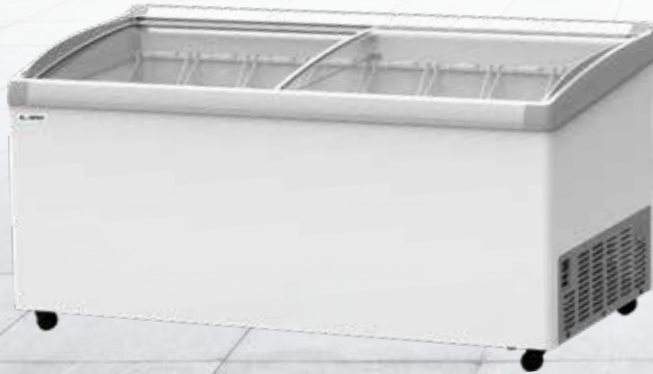
EKG 626 DL