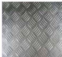
Aluminum Chequered (Available in 1.2/2/3 mm)