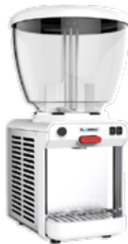
JD LJH 20