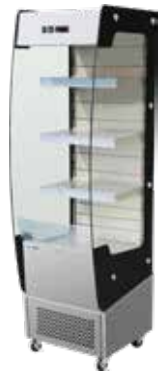
ABSS 220 - Multi Deck