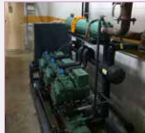
Bitzer Rack Systems