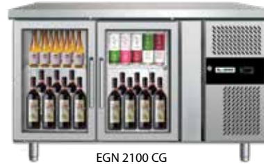
EGN 2100 CG (available in 3 door)