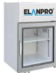
SD 51 C