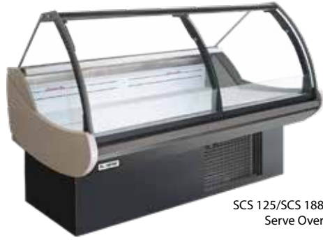
SCS 125/SCS 188 Serve Over

Elanpro brings to India the most advanced merchandising solution with innovative cooling options applicable for large hypermarkets, supermarkets as well as modern-day kirana stores. Leading brands like Big Bazar, Easy day, Nilgiri, More, CCD essentially patronise Elanpro solutions for their display and merchandising application.