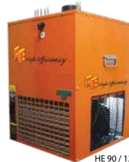
HE 90 / 120