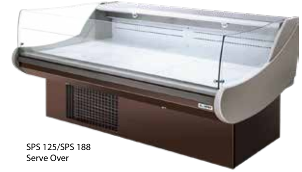
SPS 125/SPS 188 Serve Over