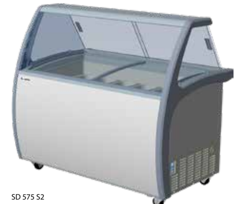
SD 575 S2