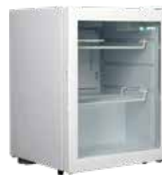
RF 60 G