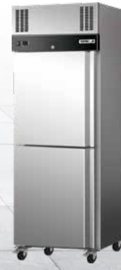
CGN 600 C2/F2 EGN 650 C2/F2 CGN 600 CF RI 551 C2/F2