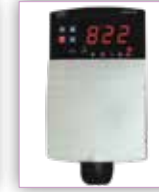
Digital Temperature Display