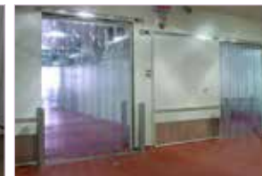
Strip Curtain (as required)