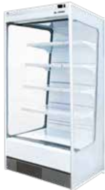
Plug-in Multi Deck SF 100 / 125 / 188 / 250