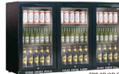
EBB 3D/3D SS