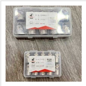
P-80 Blackwolf Nozzles