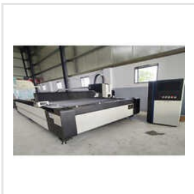
3KW Fiber Laser Cutting Machine