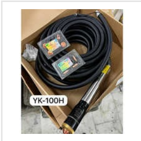
YK-100H Plasma Cutting Torch