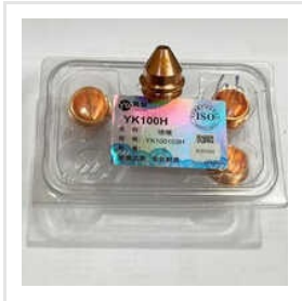
YK100H Electrode Nozzles