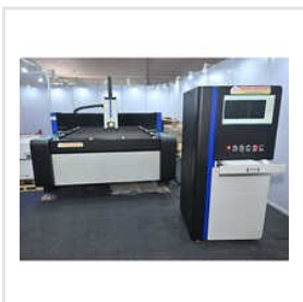
CNC Fiber Laser Cutting Machine