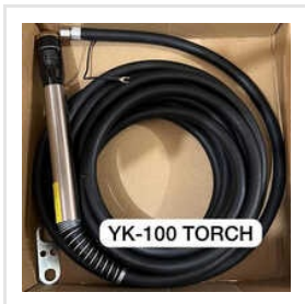
Yk-100 Plasma Cutting Torch