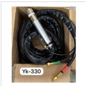
YK-330 Plasma Cutting Torch