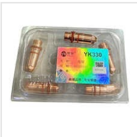
YK330 Electrode Nozzles