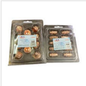
YGX100A Electrode Nozzles