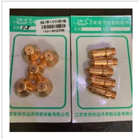
Copper Electrode Nozzles