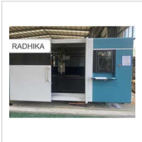
1500x3000mm 3kw CNC Fiber Laser Bed