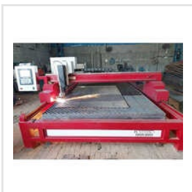
CNC Plasma Cutting Machine