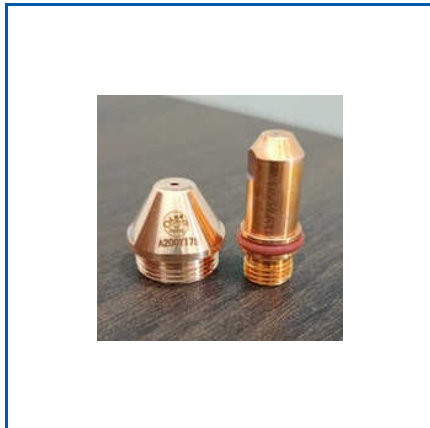
A200Y17S ELECTRODE NOZZLES