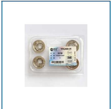
YK200-H ELECTRODE NOZZLES