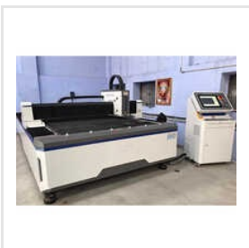
1KW Laser Cutting Machine