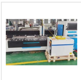
2000x4000mm 3kw CNC Fiber Laser