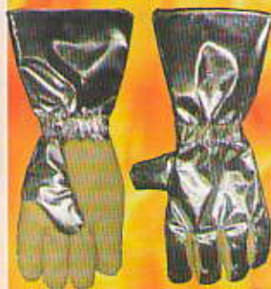
High Temperature Palm Aramid Gloves With Aluminium Cuff

Firetex Protective Technologies (P) Limited manufactures & offers special gloves for different high heat contact applications. The main criteria are the material of these gloves. According to the uses we choose the materials which can sustain to the contact & radiation heat.