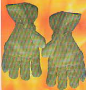
Aramid With Back Leather Gloves