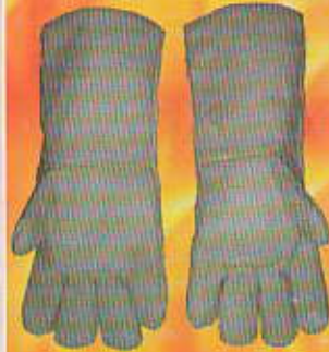
High Temperature Ceramic Gloves