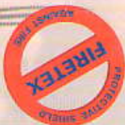
Heavy Duty Aramid Gloves

Regd. Office : Dee - Kay Estate, Lake Road, Bhandup (West), Mumbai - 400 078. (INDIA) ■ Website : www.firetex.in ■ email : info@firetex.in ■ Fax : +91 22 41585959 ■ Tel : +91 22 41585959