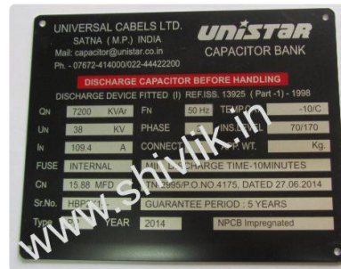
SI No. stickers