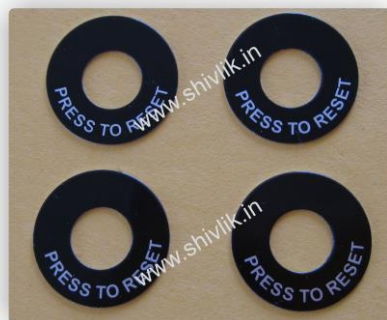
Aluminium Name Plates