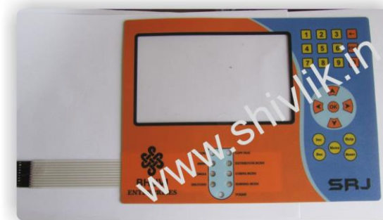
Membrane key Labels