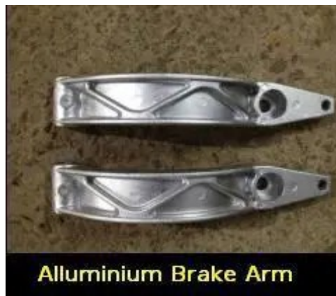
Alluminium Brake Arm