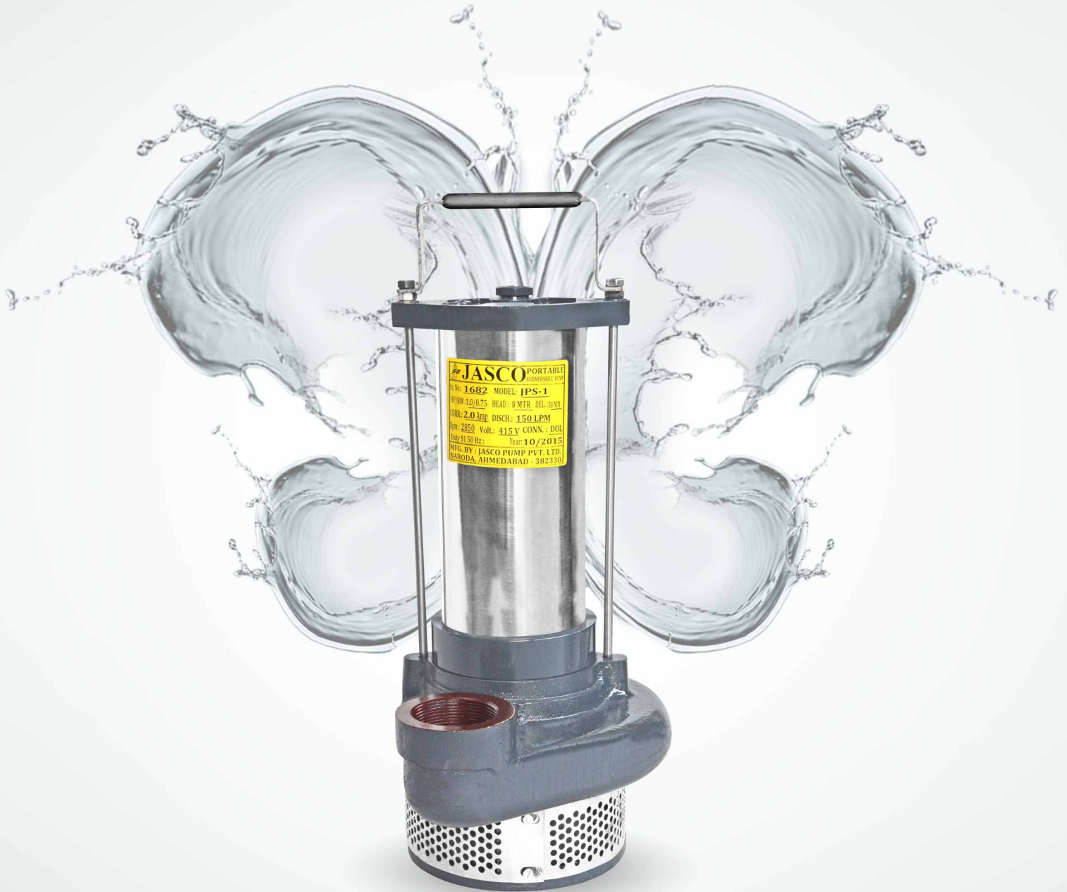
PORTABLE SUBMERSIBLE PUMP