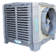
Compact Air Cooler