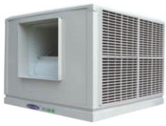
Evaporative Air Cooler