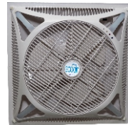
Air Circulator Fans