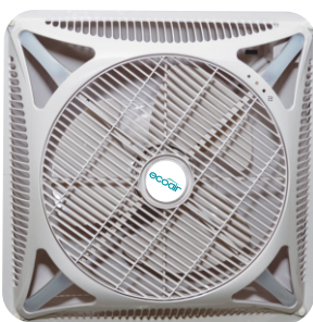
Without LED (EAAC01)