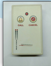
Wearable pendant Wb1