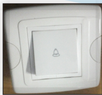
Wall mounted Call switch Cb1