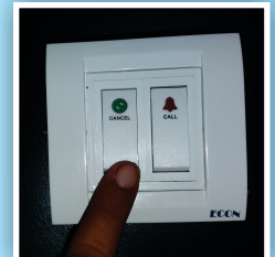
Bed side unit Bs1