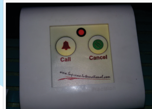
Bed side unit Bm1