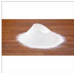
MAGNESIUM CARBONATE LIGHT

Ammonium Chloride, Ammonium Sulphate Crystal, Ammonium Sulphate Powder, Calcium Chloride Lumps, Calcium Chloride Powder, Copper Carbonate, Copper Sulphate, Di Calcium Phosphate, Ferrous Sulphate, etc.