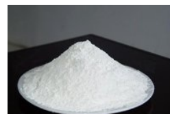
Ammonium Sulphate Powder