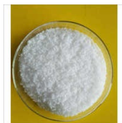
Zinc Sulphate Heptahydrate Purified