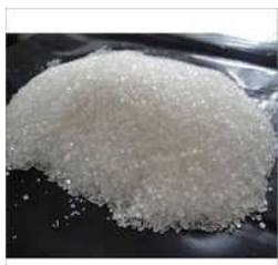
Ammonium Sulphate Crystal