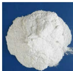
Calcium Chloride Powder