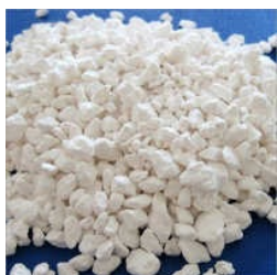
Calcium Chloride Lumps