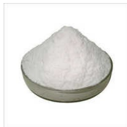
Zinc Sulphate Monohydrate