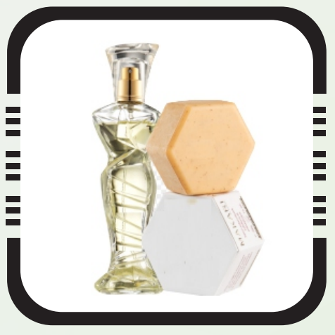
Scouring And Washing Bar Fragrances