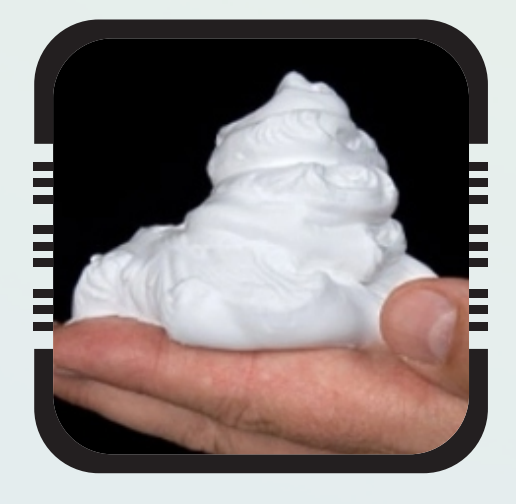
Shaving Cream Fragrances