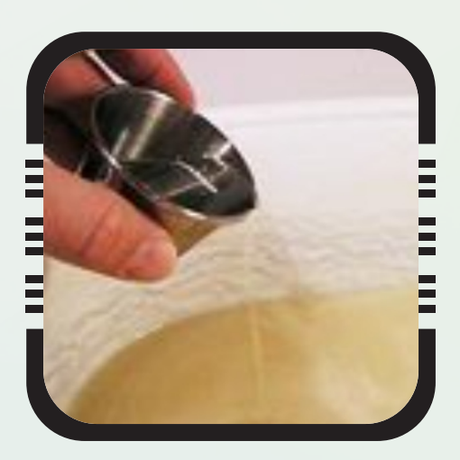
Liquid Soap Fragrance