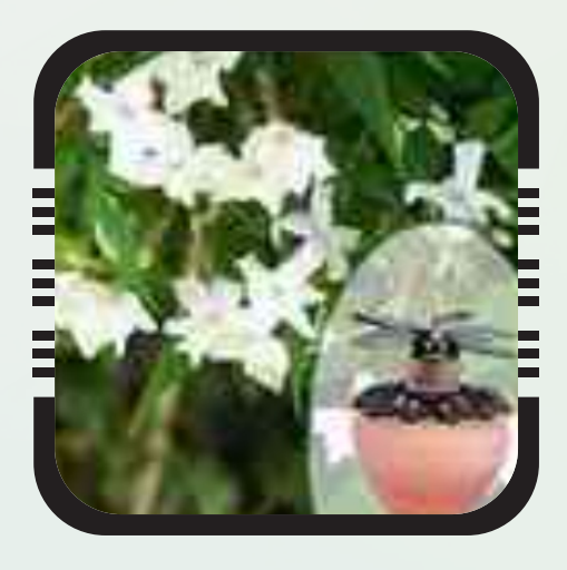
Hair Oil Perfume