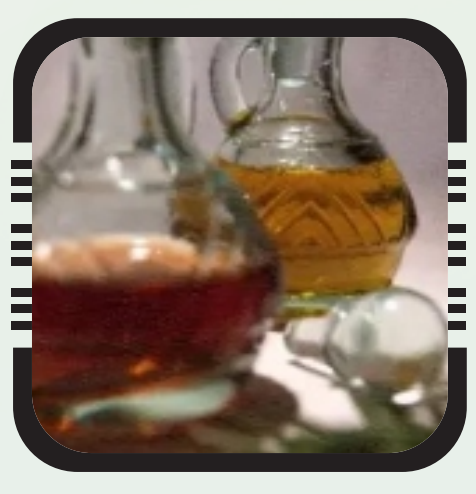
Hair Oil Fragrance