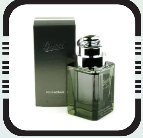
Aftershave Lotion Fragrances