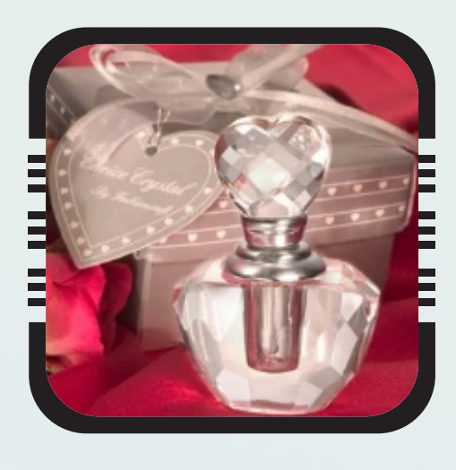
Fancy Perfume Fragrances