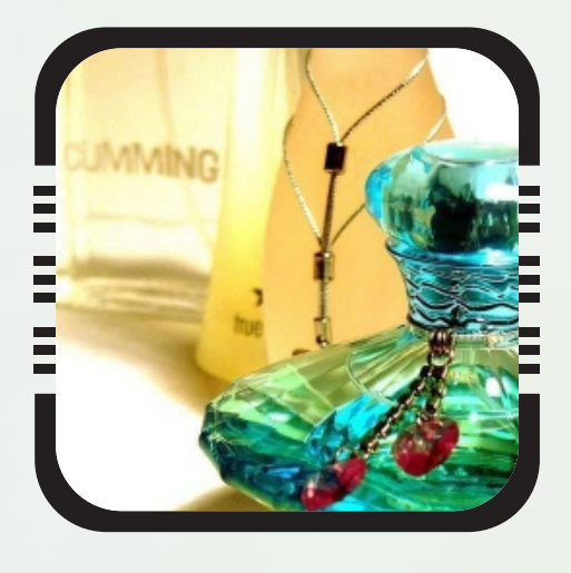
Toilet Soap Fragrances