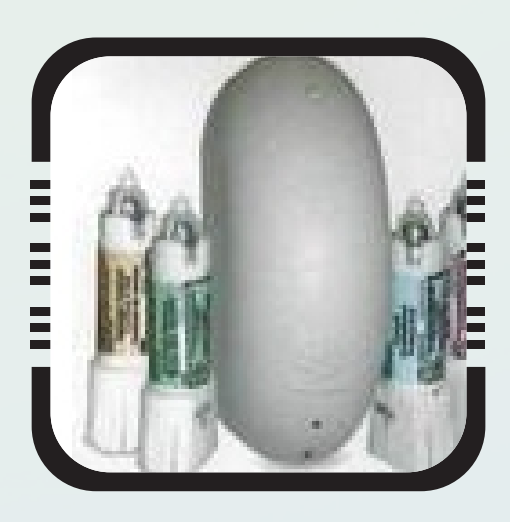
Room Freshener Perfume