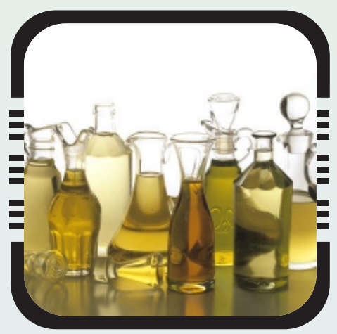
Room Refresher Perfume