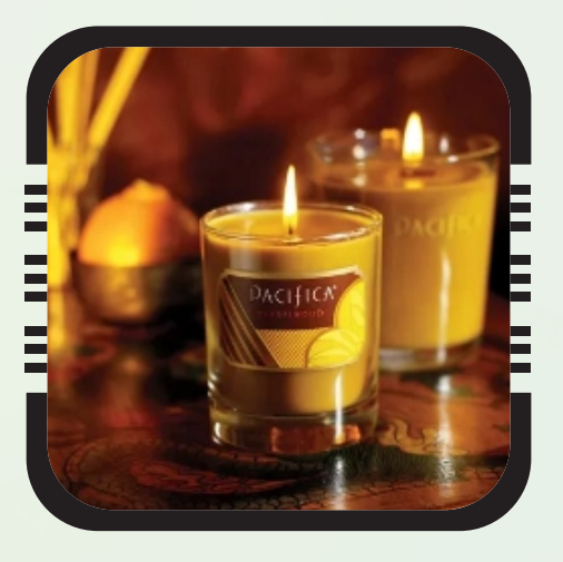
Sandal Perfume Compound