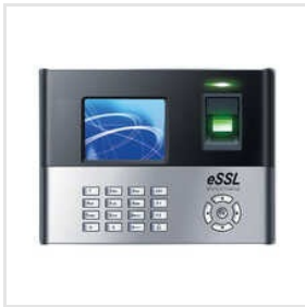
Biometric Fingerprint Time Attendance