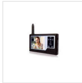
Wireless Video Door Phone