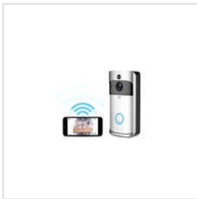
Smart Video Door Phone