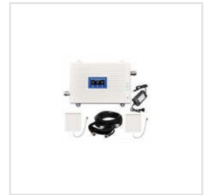
Mobile Phone Signal Booster