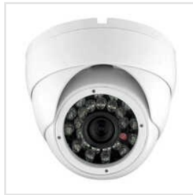
CCTV Dome Camera