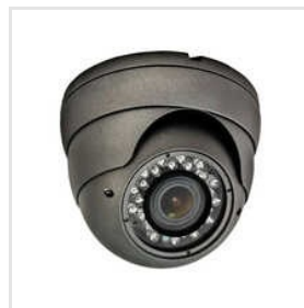
IR Infrared Dome Camera