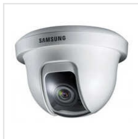
Samsung CCTV Dome Camera