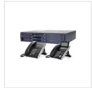
EPABX Intercom System