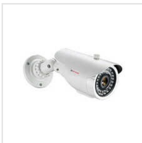
CP Plus CCTV Bullet Camera