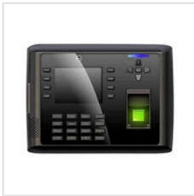
Camera Fingerprint Time Attendance