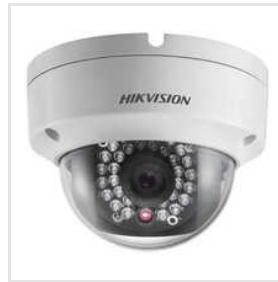
Hikvision Dome Camera