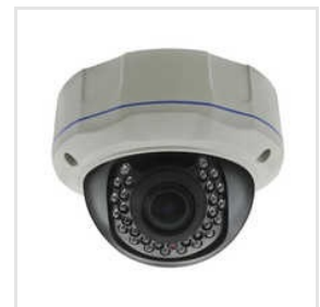
HD CCTV Camera