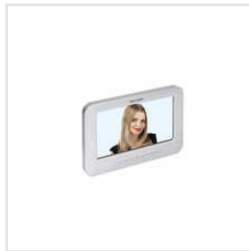
Analogue Video Door Phones