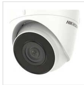
Hikvision IP Dome Camera