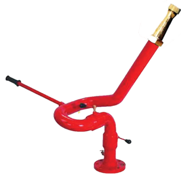
As per IS : 8442 Type (1)