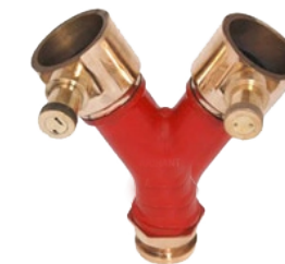
G.M. Dividing Breeching