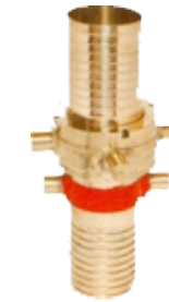
G.M. Suction Coupling