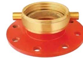
C.I. Draw out Connection