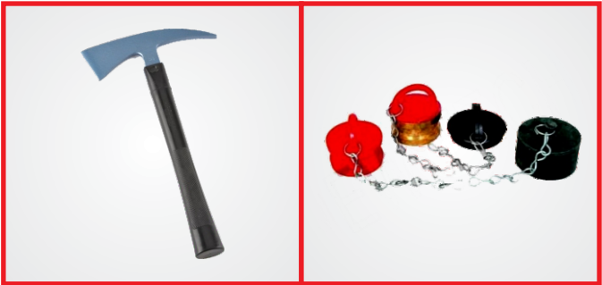
FIRE MAN AXE