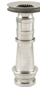
Triple Purpose Nozzle