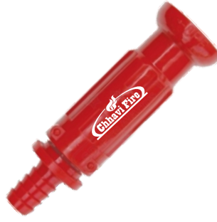
Jet Spray Nozzle