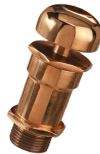
G.M. Air Release Valve