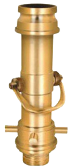
Hand Controlled Nozzle