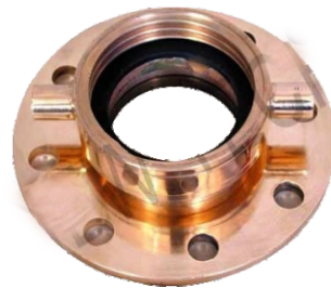
G.M. Draw out Connection