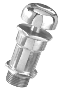
Aluminum Air Release Valve