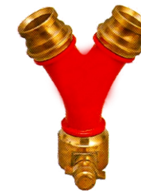
GM Collecting Breeching