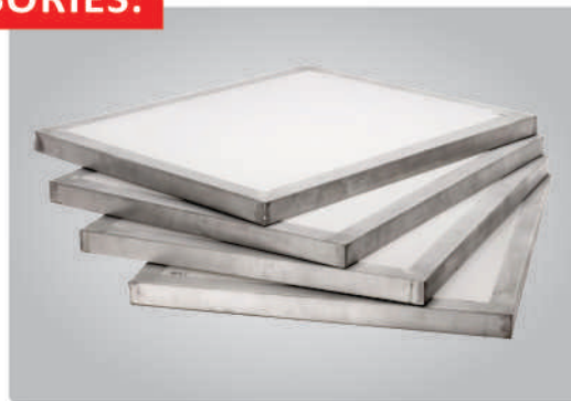
Aluminium Tabular Frame