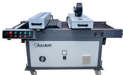
UV Conveyor for Screen Printing