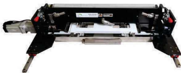
Retro-Fit Tresu Anilox Coating Module