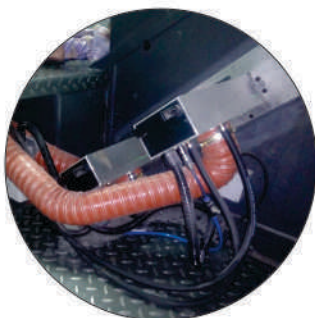
Water Cool EOP