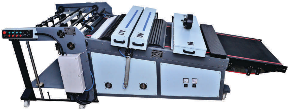
UV Dryer suitable for Heidelberg SORM or equivalent press