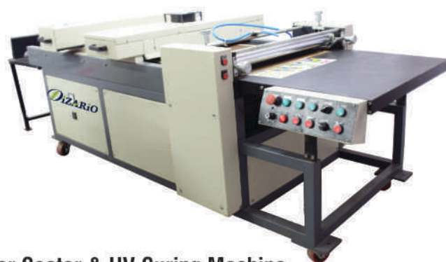
Roller Coater & UV Curing Machine