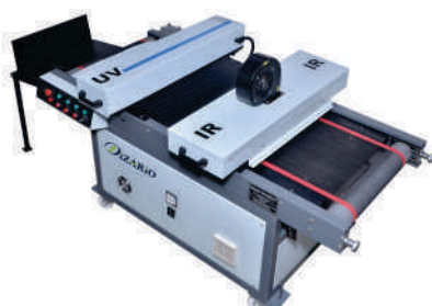
UV Dryer suitable for Dominant Hi-Pile & Low Pile Adjustable