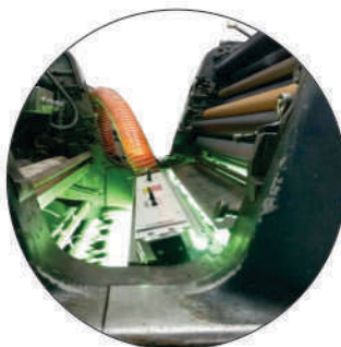
Intermediate with Water Cool Interdeck