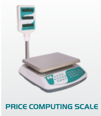
TABLE TOP SCALES