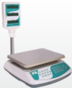
PRICE COMPUTING SCALE