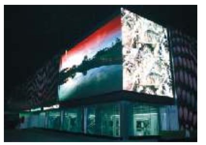
P8 Cabinet Full Colour LED