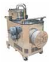
Stainless/Flame proof models