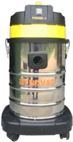
Prime - I