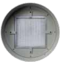
HEPA filter (H14)