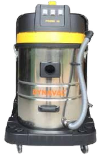
Prime - III