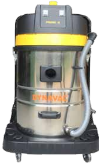
Prime - II