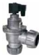
Automatic cleaning system