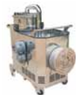
Stainless/Flame proof models