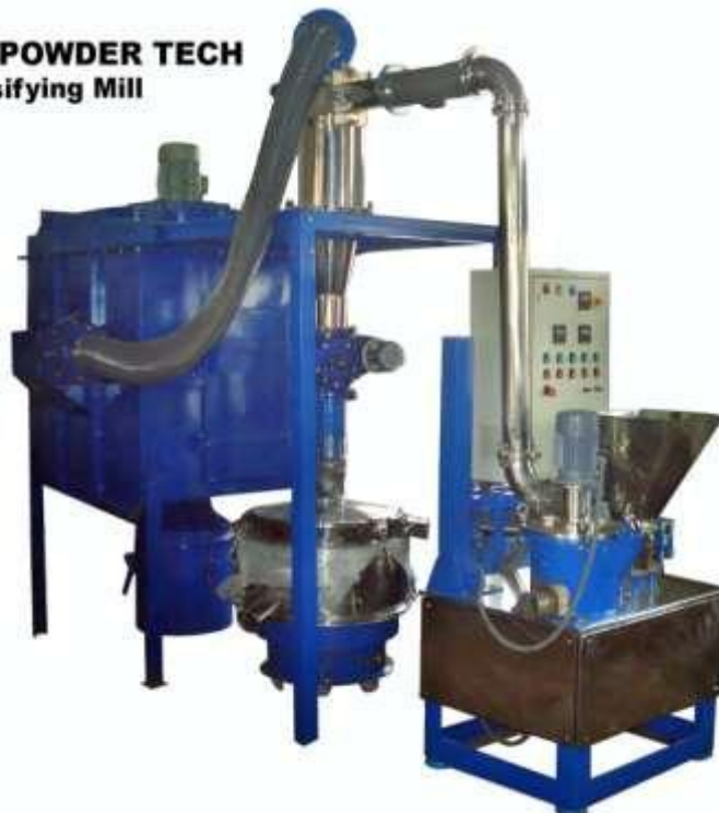
ACM GRINDING MILL MPT-10 WITH SIFTER-30 (SIEVING MACHINE)