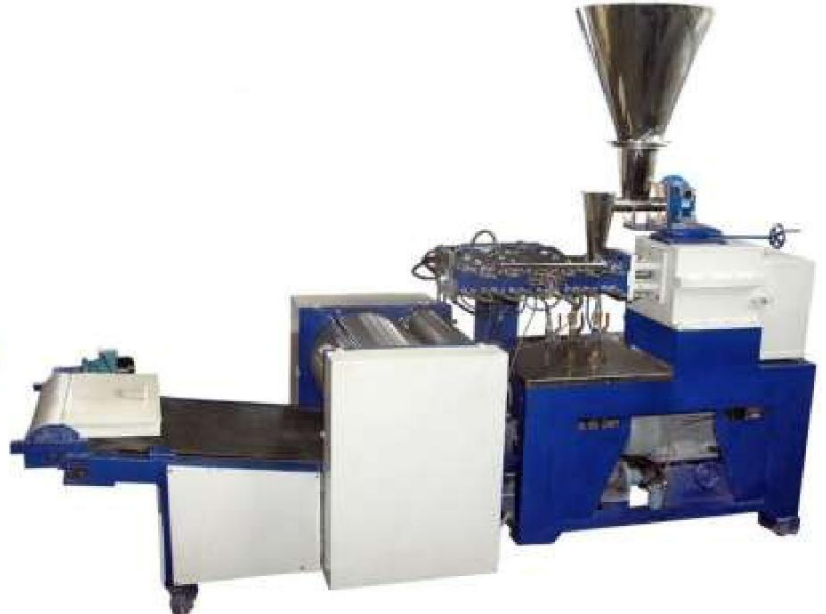
TWIN SCREW EXTRUDER MPT45PC WITH CHILL ROLL & FLAKER