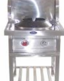
Single Burner (Chinese)