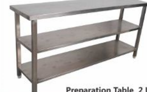
Preparation Table 2 US