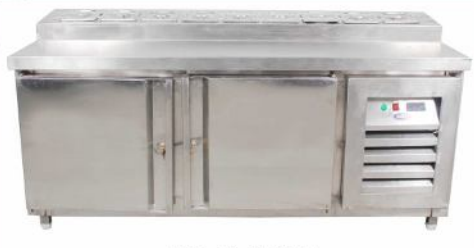
UCR with Cold BM