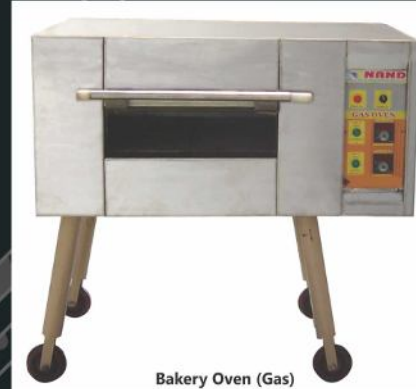
Bakery Oven (Gas)