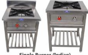
Single Burner (Indian)