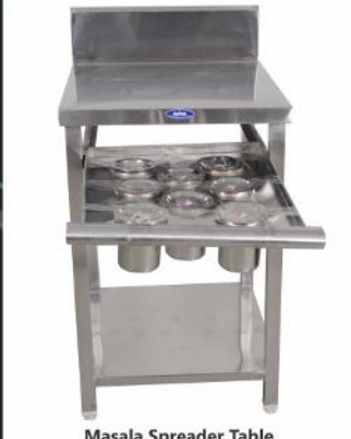
Masala Spreader Table