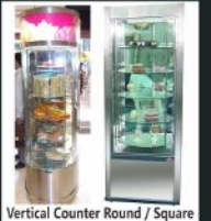
Vertical Counter Round / Square