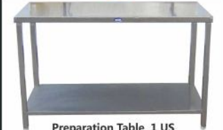
Preparation Table 1 US