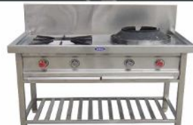
2 Burner (Comby)