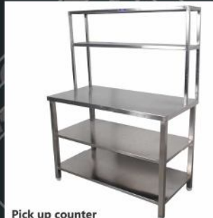
Pick up counter