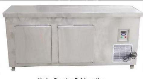
Under Counter Refrigeration