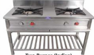
Two Burner (Indian)