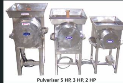
Pulveriser 5 HP, 3 HP, 2 HP