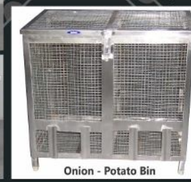
Onion - Potato Bin