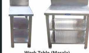
Work Table (Masala)