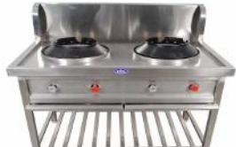
Two Burner (Chinese)