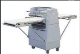
Dough Sheeter (Stand Model) Also Available Table Top Model