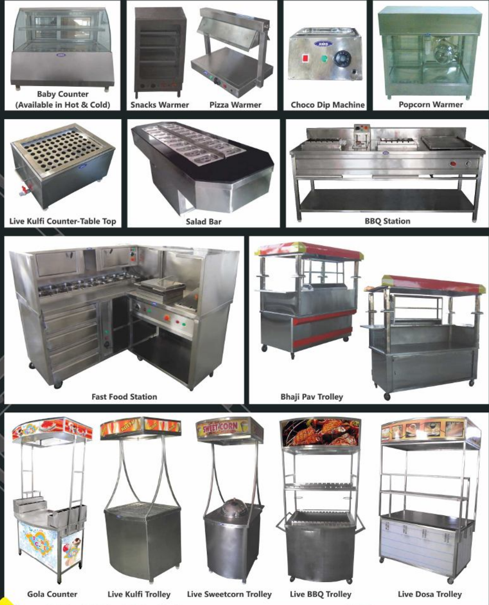
Baby Counter (Available in Hot & Cold)