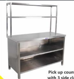
Pick up counter with 3 side close