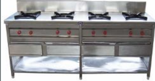
Four Burner (Indian)