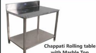
Chappati Rolling table with Marble Top