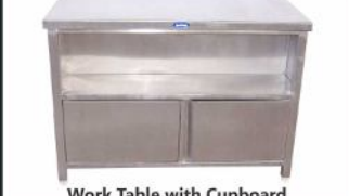
Work Table with Cupboard