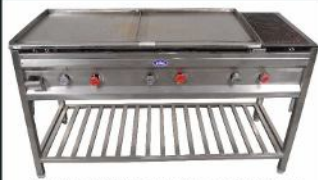
Paratha Griddle cum Chappati Puffer