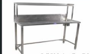
Soil Dish Landing Table