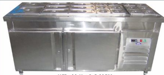
UCR with Hot & Cold BM