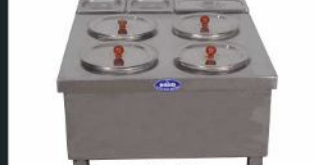
Pani Puri Live