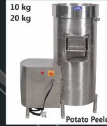
10 kg 20 kg