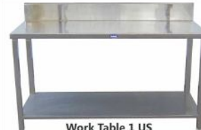
Work Table 1 US