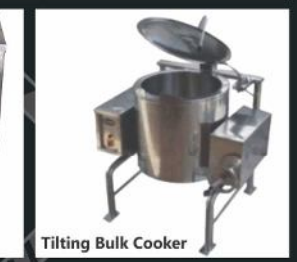
Tilting Bulk Cooker