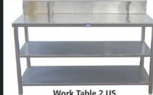
Work Table 2 US