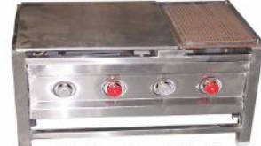
Table Top Chappati Puffer