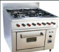
Six Burner (Continental) with underneath oven