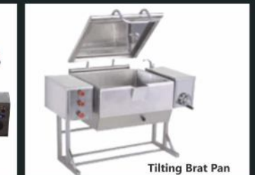
Tilting Brat Pan