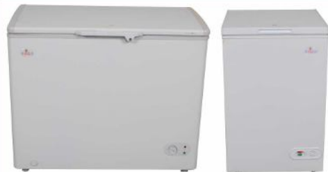
Chest Freezer 100 to 500 ltr.