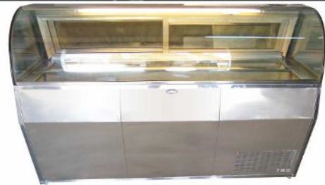
Ice Cream / Shrikhand Parlour