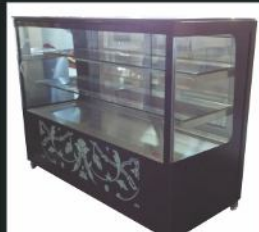
Straight Glass Counter