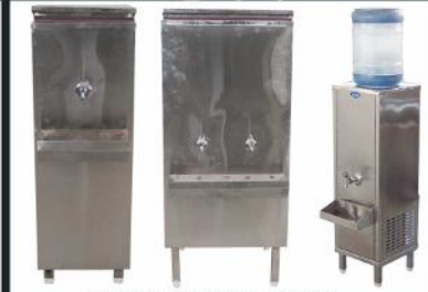
Water Cooler 20 ltr. to 500 ltr.