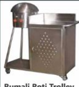
Rumali Roti Trolley