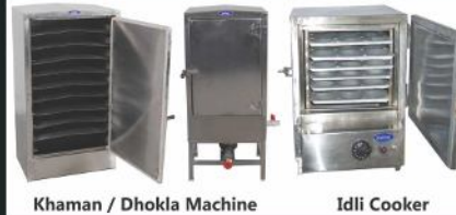
Khaman / Dhokla Machine