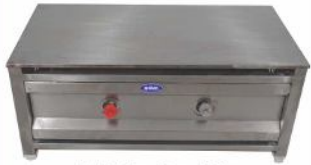
Table Top Dosa Plate