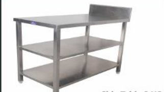
Side Table 2 US