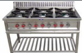
Six Burner (Continental)