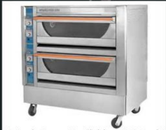
2-Deck Oven (Available 1 & 3 Deck)