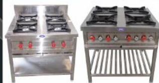
Four Burner (Continental)