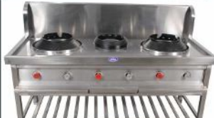
Three Burner (Chinese)