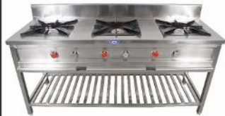
Three Burner (Indian)