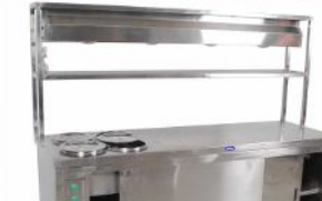
Pick up counter with Hot Case & RR System