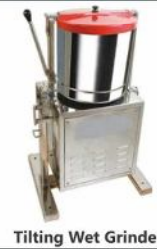
Tilting Wet Grinder