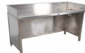
Soil Dish Table