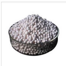
Activated Alumina Ball