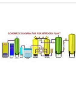
PSA Nitrogen Gas Plant