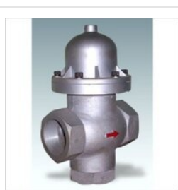
VENT Control Valve