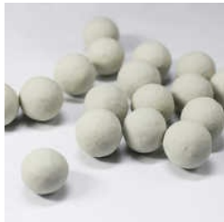
INERT CERAMIC BALLS

15mm Pneumatic Tube, 240 V Dew Point Sensor, 4A Zeolite, Activated Alumina Ball, Activated Carbon Block, Activated Carbon Filter, Activated Carbon Granules, Activated Carbon Pallets, Activated Carbon Powder, Activated carbon pallets, Air Line Filter Element, Air Receiver Vessel, Alumina Ball, Analog Pressure Gauge, Angle Valves, etc.