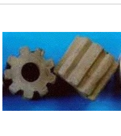
NICKEL CATALYST RIBS TYPE