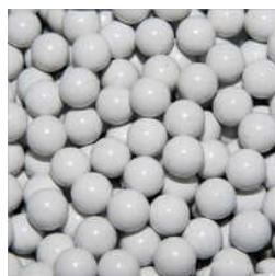
White Ceramic Ball