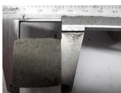
NICKEL CATALYST CUBE