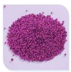
KMnO4 Activated Alumina Ball