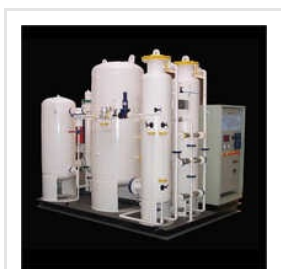
Nitrogen Gas Plant