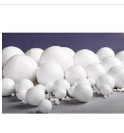
White Alumina Ball