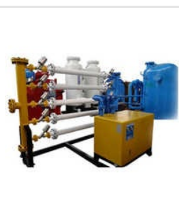
Membrane Nitrogen Plant