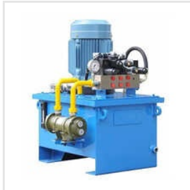
Hydraulic Power Pack