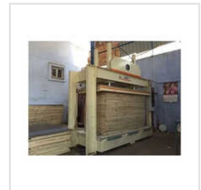
150 Ton Hydraulic Cold Press Machine