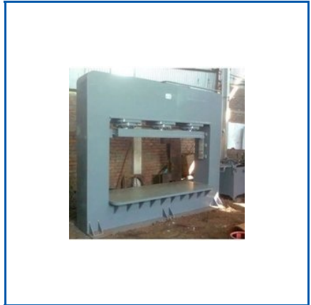
500 TON HYDRAULIC PRESS