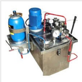
SS Hydraulic Power Pack