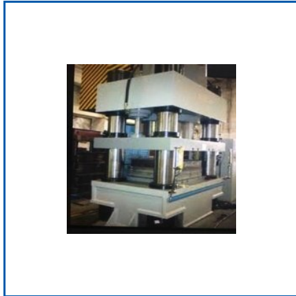
1000 TON HYDRAULIC PRESS