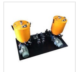
Dual Line Lubrication System