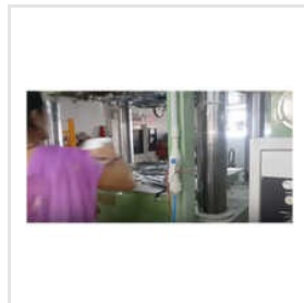
200 Ton Hydraulic Crockery Melamine