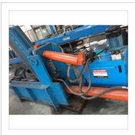
Scrap Bailing Hydraulic Press