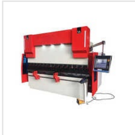
Hydraulic 4 Meter Press Brake Machine