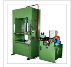
200 Ton Hydraulic Power Press