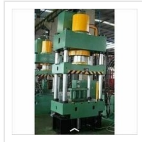
250 Ton Hydraulic Power Press