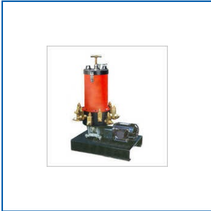
GREASE RADIAL PUMP

100 Ton Hydraulic Press Machine, 1000 Ton Hydraulic Press, 1200 Hot Forging Hydraulic Press, 150 Ton Double Bed Hydraulic Press, 150 Ton Hydraulic Cold Press Machine, 150 Ton Hydraulic Deep Draw, 20 Ton Hydraulic Spindle Press, etc.