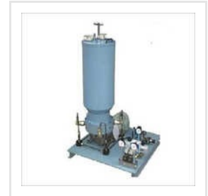
Dual Line Lubrication System