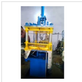
200 Ton Transfer Moulding Hydraulic