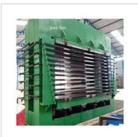
Hydraulic Hot Plywood Machine