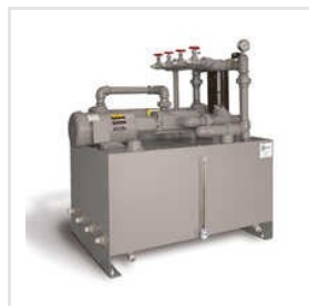
Oil Circulating System