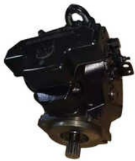
Danfoss Hydraulic Pump