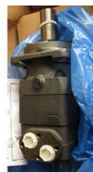
DANFOSS OMT HYDRAULIC MOTOR