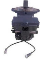
Rexroth A4VG Series Hydraulic Pump