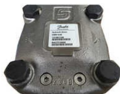
Danfoss OMV Hydraulic Motor