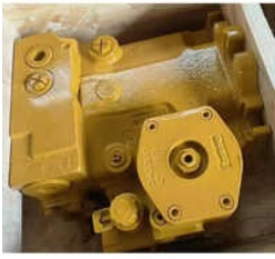
CAT Hydraulic Pump