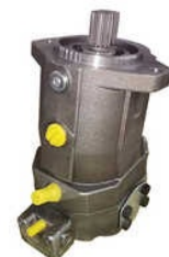
717 Rexroth Variable Motor