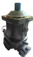
A36VM HYDRAULIC MOTOR