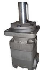
212 Danfoss OMT Hydraulic Motor