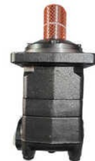
414 Danfoss OMV Hydraulic Motor