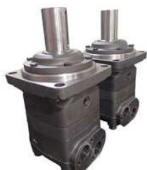
DANFOSS ORBITAL MOTOR

111 Danfoss Hydraulic Pump, 212 Danfoss OMT Hydraulic Motor, 313 Danfoss OMV Hydraulic Motor, 414 Danfoss OMV Hydraulic Motor, 515 Danfoss Orbital Motor, 626 Rexroth Piston Pump, 717 Rexroth Variable Motor, A36VM Hydraulic Motor, A4VG series Hydraulic Pump, Bent Axis Pump, Bucher Gear Pump, CAT Hydraulic Pump, Caterpillar Hydraulic Pump, Concrete Mixer Hydraulic Pump, Cylinder Block For Piston Pump, etc.