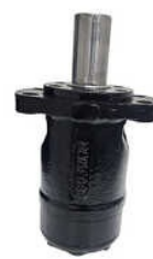
Danfoss Hydraulic Motor