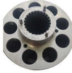
Cylinder Block For Piston Pump