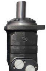
Danfoss Otbital Motor