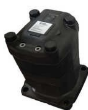
515 Danfoss Orbital Motor