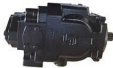
Danfoss FRR Series Hydraulic Pump