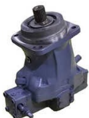
Rexroth Variable Motor