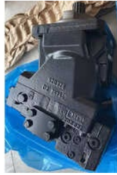
111 Danfoss Hydraulic Pump