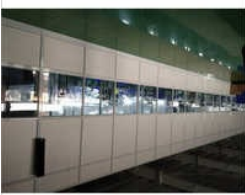
Corporate Office Aluminium Partitions