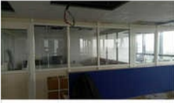
Aluminum Office Partition