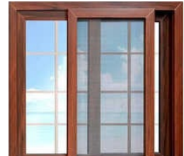
Wooden Finish Aluminium Sliding