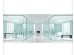
Frameless Glass Partitions