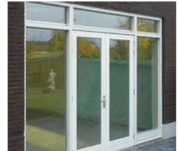
Rectangular Balcony Aluminium Window