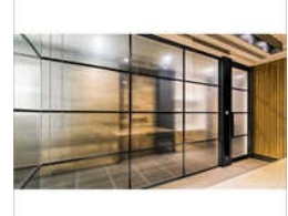
Corporate Acoustic Aluminium Partition