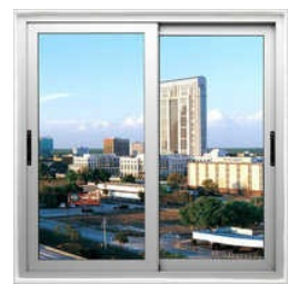
Aluminium Sliding Window