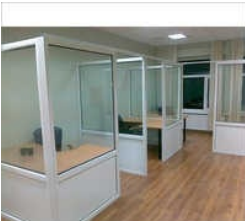
Cubical Aluminium Partition