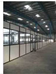
Factory Office Aluminium Partition