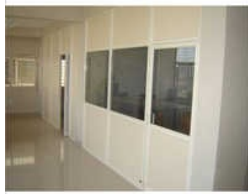
12Ft Aluminium Partition