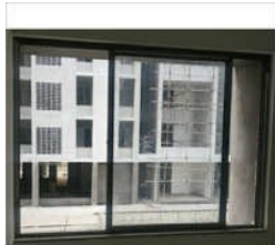
2 Track With Fix Partition Aluminium