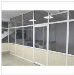
Powder Coated Aluminium Office