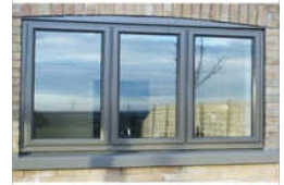
Fixed Aluminium Window