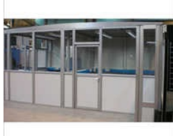
Aluminium Frame Partition