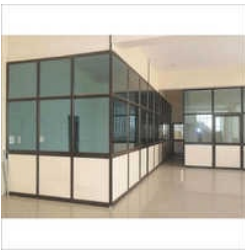
Commercial Aluminium Partition