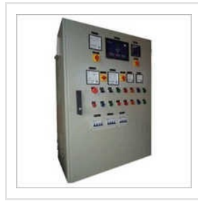
Industrial Electrical Control Panel