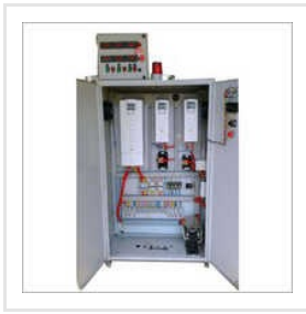
AC Drive Panel