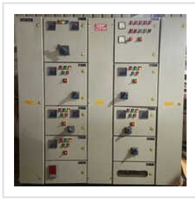
440 V Three Phase PCC Electric Control Panel