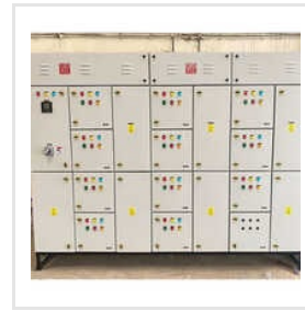
415 V Three Phase MCC Electric Control Panel