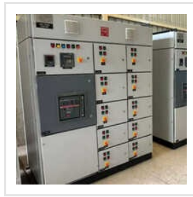
440 V Three Phase APFC Electric Control