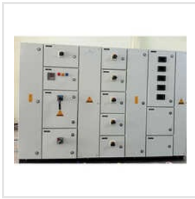
LT Distribution Electric Control Panel