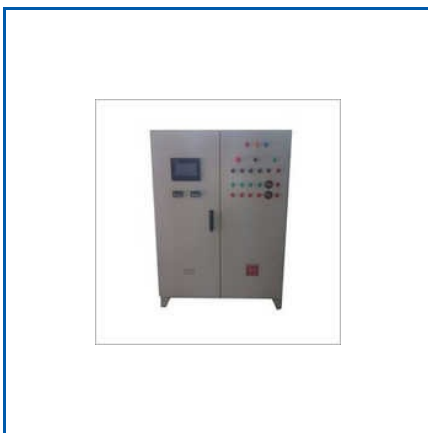
ELECTRICAL CONTROL PANEL

1000 A Three Phase LT Distribution Panel, 100A Three Phase PLC Control Panel, 2 Zone Automatic Fire Pump Control Panel, 200 A MCCB Distribution Panel, 200 kg PVC Belt Conveyors System, 2000A Auto Changeover Panel, 200A Three Phase PLC Control Panel, 250A ACB Distribution Panel, 300 A MCCB Distribution Panel, 4 Zone Automatic Fire Pump Control Panel, 415 V Three Phase MCC Electric Control Panel, 415 V Three Phase VFD Electric Control Panel, 415V Single Phase PLC Electric Control Panel, 440 V Three Phase APFC Electric Control Panel, 440 V Three Phase PCC Electric Control Panel, etc.