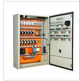
415V Single Phase PLC Electric Control Panel