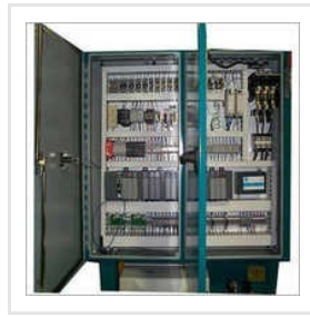
PLC Control Panel