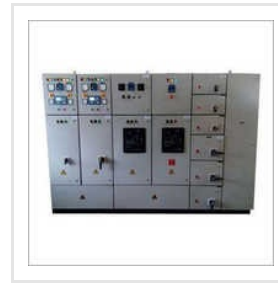
Variable Timer Control Panel