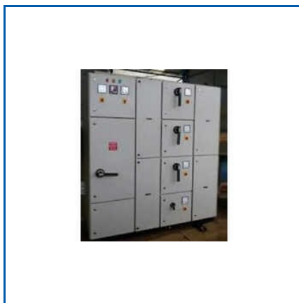
PCC CONTROL PANEL