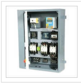
Star Delta Panel