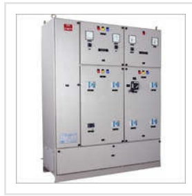
Motor Control Panel