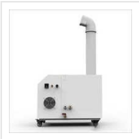
20KG Ultrasonic Humidifier