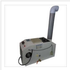
23Kg Industrial Humidifier