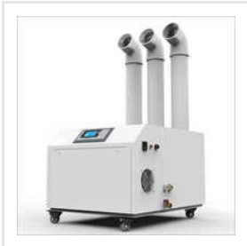
25Kg Ultrasonic Humidifier