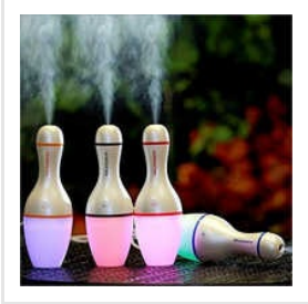
Bowling Shaped Air Freshener Portable