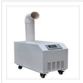
10 Kg Ultrasonic Humidifier