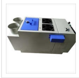
5 Kg Ultrasonic Humidifier