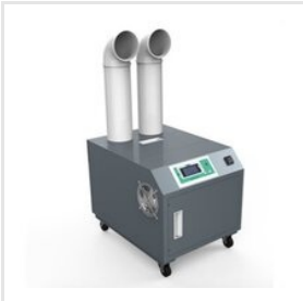
10 Kg Ultrasonic Humidifier