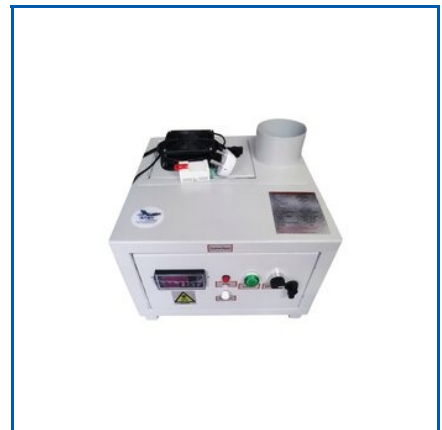
COLD STORAGE HUMIDIFIER