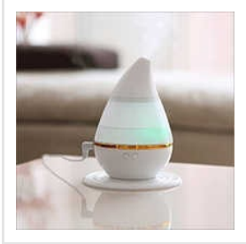
Baby Bedroom Portable Humidifier