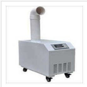
Higher Capacity Ultrasonic Humidifier