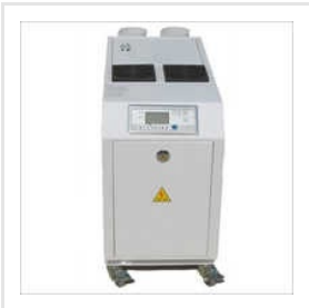
Semi Automatic Industrial Humidifier