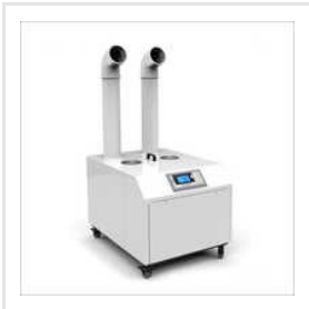
Cold Storage Industrial Humidifier