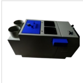
15 Kg Ultrasonic Humidifier