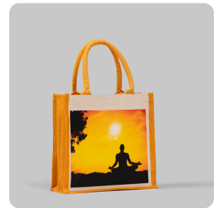
Jute Carry Bag