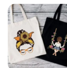
Logo Printed Bags