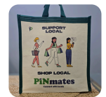
Logo Printed Bags