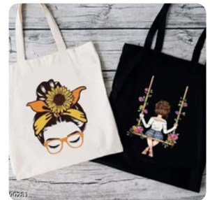
Logo Printed Bags