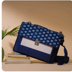
Designer Laptop Bags