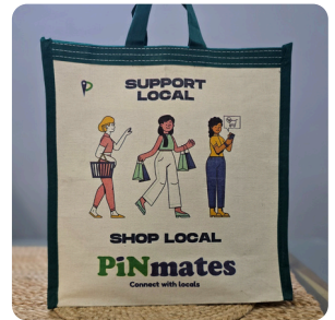
Logo Printed Bags