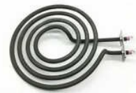
Micro Coil Electric Heater