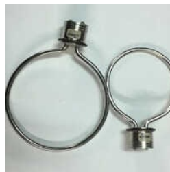
ROUND ROD ELECTRIC HEATER