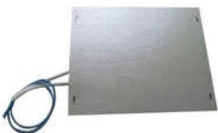
Mica Plate Electric Heater