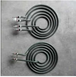
Coil Electric Heater