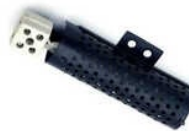
Panel Space Electric Heaters