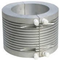
Aluminium Casted Electric Heater