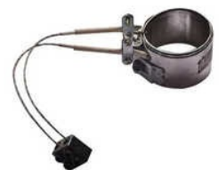
Mica Nozzle Electric Heaters