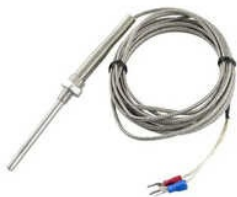
J TYPE THERMOCOUPLE ELECTRIC HEATER

Cartridge Heaters, Ceramic Heater Plate, Ceramic Heating Element, Coil Heaters, Drum Heaters, Electric Heaters, Electric Pencil Heater, Heater Plate, High Density Cartridge Heater, Industrial Band Heater, Industrial Cartridge Heater, Industrial Circular Ceramic Band Heater, Industrial Coil Heater, Industrial Coil Nozzle Heater, Industrial Drum Heater, etc.