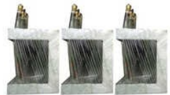
18m Electric Aluminium Heater