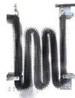
M-Type Finch Electric Heater