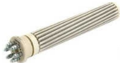
Ceramic Porcelain Electric Heater