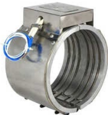
Aluminum Round Heater