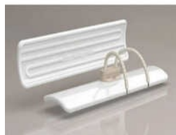
Infrared Electric Heaters