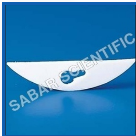
Button Type Stirrers with PTFE