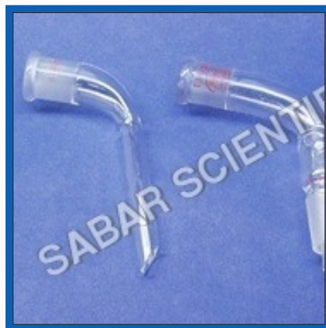
Fractional Distillation Unit