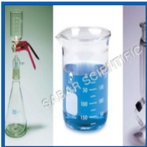
Scientific Glass Apparatus