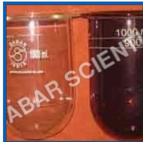
Glass Dissolution Bowl