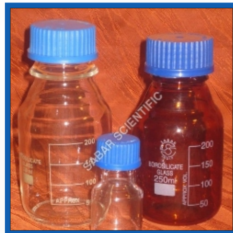
Glass Reagent Bottle