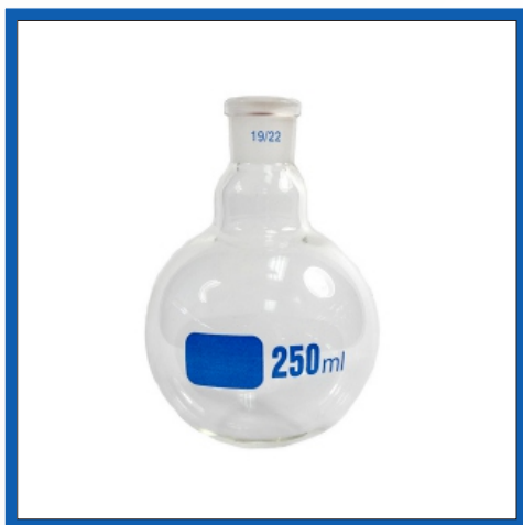
F.B.Flask with Interchangeable Joint