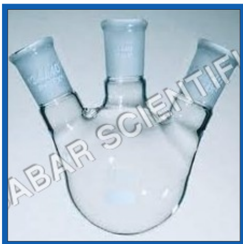
Multi-Necks Interchangeable Joints Flasks