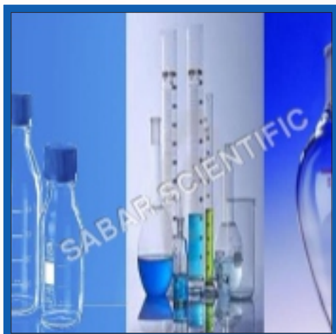
Laboratory Glass Apparatus