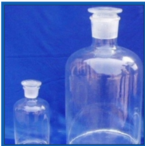
Reagent Narrow Mouth With Flat Head Stopper