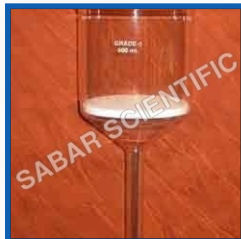
Sintered Glass Apparatus