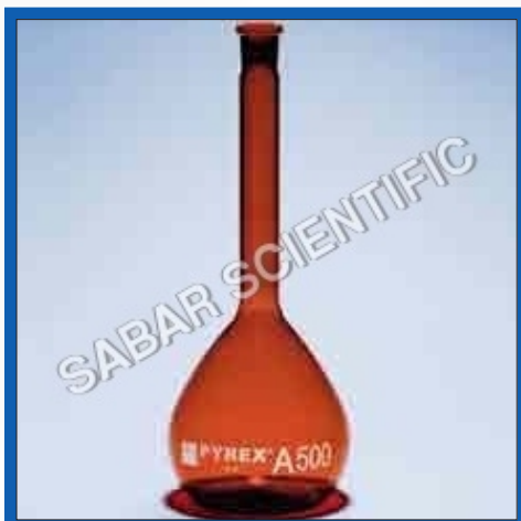
Chemistry Lab Apparatus