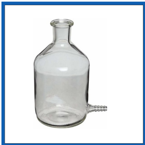
Aspirator Bottles with Outlet for Rubber Tubing