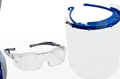
Safety Goggles Face Shield