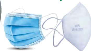
3-Ply Mask / N95 Mask