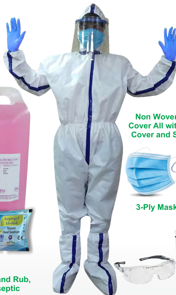
Non Woven Laminated Cover All with Hood, Shoe Cover and Safety Gloves