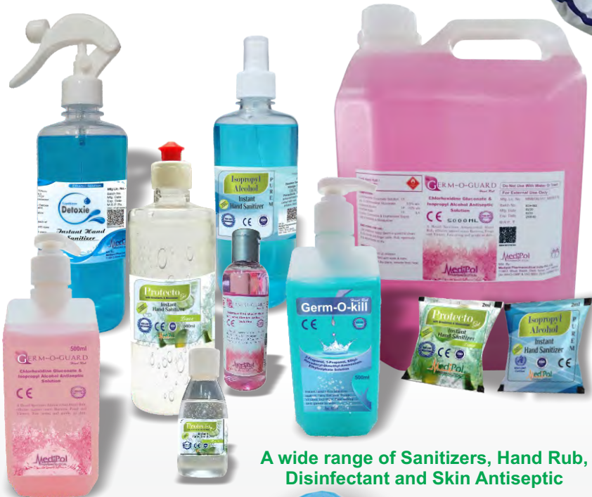
A wide range of Sanitizers, Hand Rub, Disinfectant and Skin Antiseptic