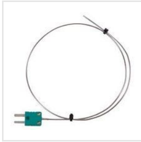
Mineral Insulated Thermocouple