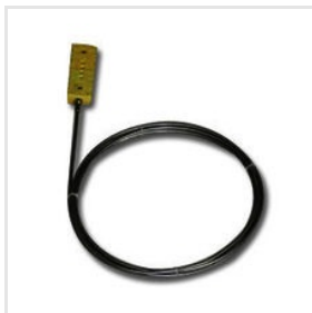
Mineral Insulated Thermocouple