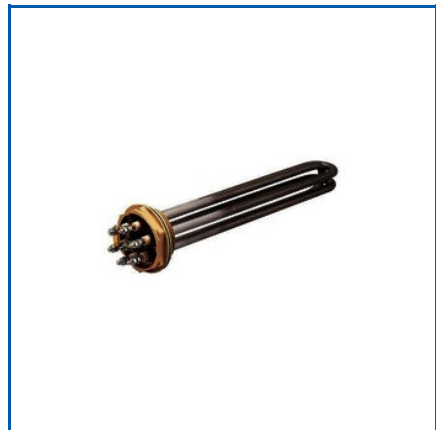
WATER IMMERSION HEATER