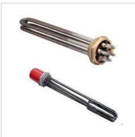
Oil Immersion Heater