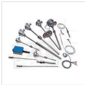
Thermocouple Type J K R S Etc