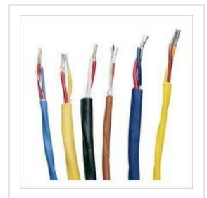
Thermocouple Compensating Cable