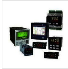
Digital Temperature Indicator