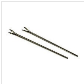
D Shape Heaters