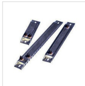
Industrial Strip Type Heaters