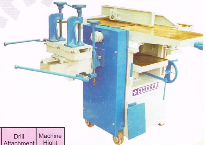
Combined Planer Machine With Drilling

Machine System : Planer Thickness Cutter Moulding