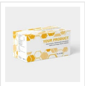
Glucosamine Methyl Sulfonylmethane