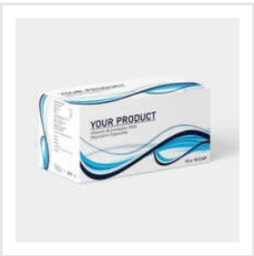
Vitamin B Complex Capsules