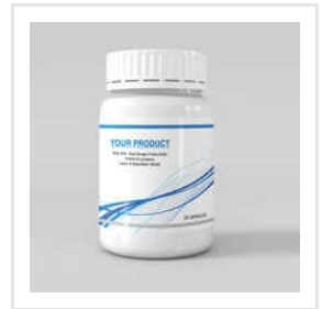
DHA, EPA, Total Omega 3 Fatty Acids, Vitamin E