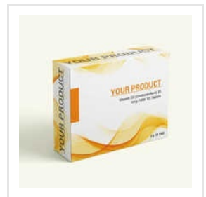
Vitamin D Calcium Malate Tablet