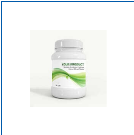
500MG SLIMTONE TABLETS