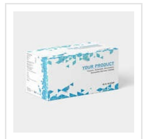
Trypsin, Rutoside, Bromelain, Boswellia