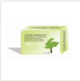
Omega-3 Fatty Acid, Green Tea Extract,