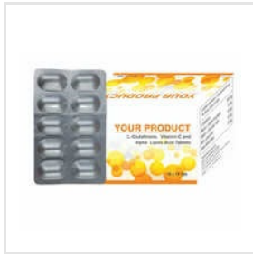
L-Glutathione, Vitamin-C And Alpha