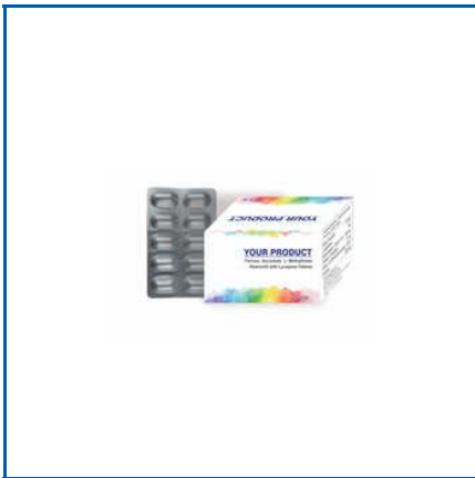
FERROUS ASCORBATE L METHYLFOLATE VITAMIN TABLETS

10 L Ornithine L Aspartate Silymarin Tablets, 105 Gram Orange Flavour Electrolyte Drink, 200ml Appetite Stimulant Syrup, 25 Kg Calcium Carbonate Granules, 500mg Slimtone Tablets, Allopathic L-ornithine L-aspartate + Silymarin Tablets, Amino Acid Multivitamin Capsules, etc.