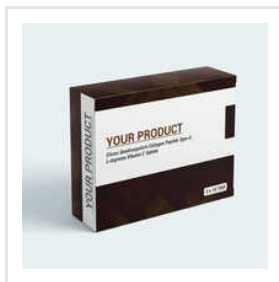
Cissus Quadrangulari Tablet