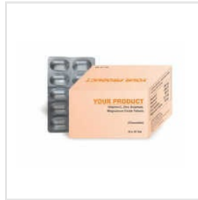
Chewable Vitamin C Tablet