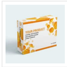
Lycopene, Multivitamins, Multi