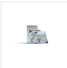
Univestin Rose Hip Extract Collagen