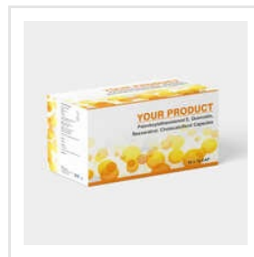
Palmitoylethanolamid E, Quercetin,