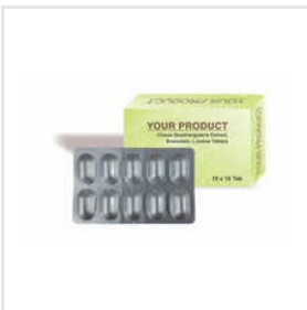
L Lysine Tablets