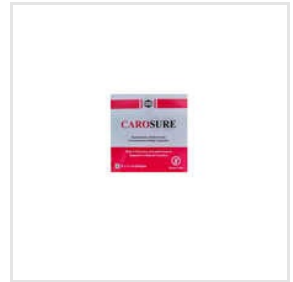
Multivitamin Multimineral Softgel