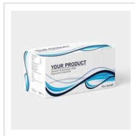
Vitamin B-Complex With Silymarin