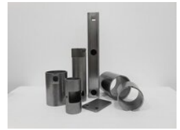
Pipe And Tube Laser Cutting Service