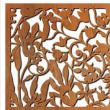
Wood Laser Cutting Services