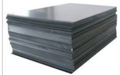
PP Sheet Cutting Services