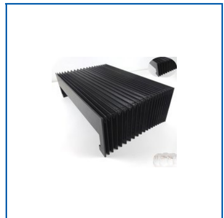
LASER MACHINE BELLOWES