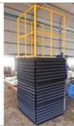
Scissor Lift Bellows