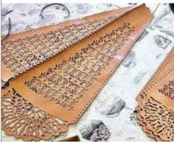
Leather Engraving Services