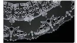
Acrylic Cutting Services