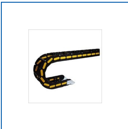
INDUSTRIAL CABLE DRAG CHAIN

Acrylic Cutting Services, Aluminium Apron Cover, Bellow Cover, Circular Bellow Cover, Duct Bellows, Fabric Cutting Services, Industrial Cable Drag Chain, Interlock Apron Cover, Laser Machine Bellows, Leather Engraving Services, Machine Covers, Metal Clad Bellow Cover, PP Sheet Cutting Services, Pipe and Tube Laser Cutting Service, Plastic Laser Cutting Services, etc.