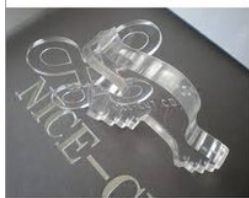
Plastic Laser Cutting Services