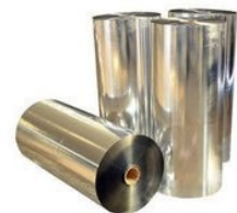
Polyester Cutting Services