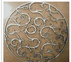
Textile Laser Engraving Service