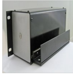
Roll Up Cover