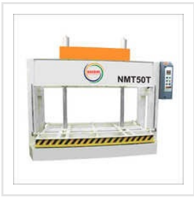
2 Cylinder 50 Ton Cold Press Machine