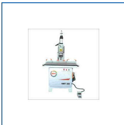
INDUSTRIAL HINGE BORING MACHINE