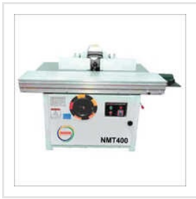
Industrial Spindle Moulder Machine