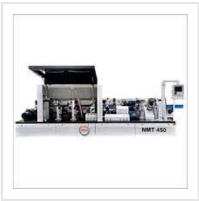
Automatic Edge Bander Machine