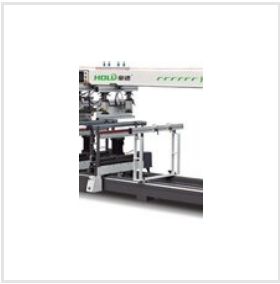
Industrial 3 Head Platform Three Row