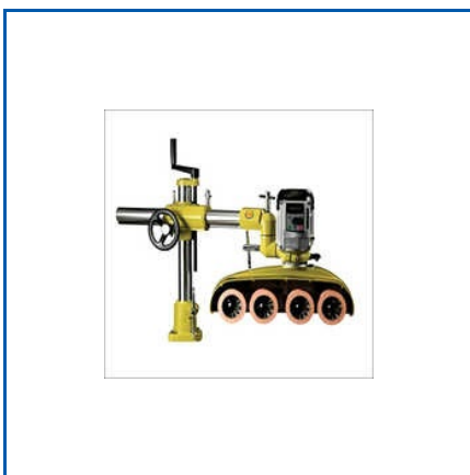
INDUSTRIAL AUTO FEEDER

100 Ton Cold Press Machine, 2 Cylinder 50 Ton Cold Press Machine, 3 Head Platform Two Row Boring Machine, 4 Cylinder 100 Ton Cold Press Machine, 4 Spindle Cnc Router, 50 Ton Cold Press Machine, 6 Side Drill Machine, 611 J Automatic Edge Banding Machine, Auto Edge Banding With Corner Round Machine 611, Autoloading Beam Saw Machine, Automatic Edge Bander Machine, etc.