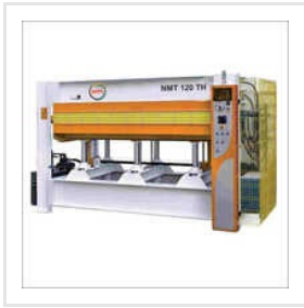
Single Layer Hot Press Machine