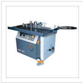
Manual Edge Bander Machine