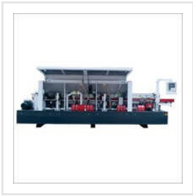
Electric Automatic Edge Bander Machine