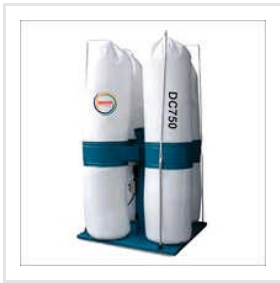
Reusable Dust Collector