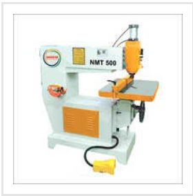
Pneumatic High Speed Router Machine