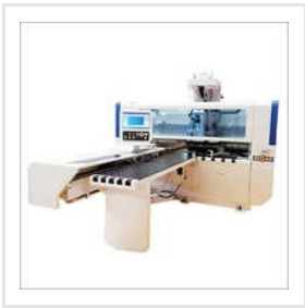
6 Side Drill Machine