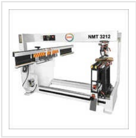
3 Head Platform Two Row Boring Machine