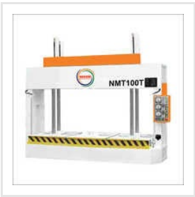
4 Cylinder 100 Ton Cold Press Machine