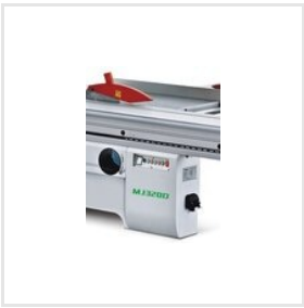
Automatic Panel Saw Machine