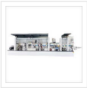
Industrial Automatic Edge Bander Machine