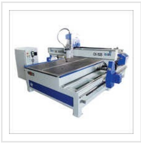
Industrial CNC Router Machine