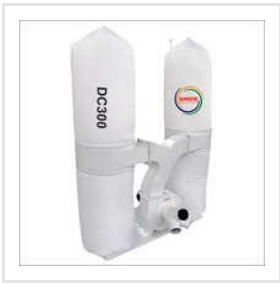
Industrial Dust Collector