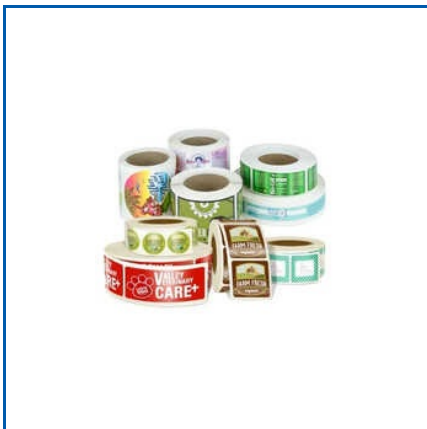
PRE PRINTED SELF ADHESIVE LABELS

Adhesive Barcode Labels, Black Premium Wax Resin Barcode Ribbon, Black Wax Resin Barcode Ribbon, Black Wax Thermal Transfer Ribbons, Direct Thermal Barcode Label, Direct Thermal Label, Jewellery Printed Labels, PVC Void Labels Sticker, Paper Barcode Plain Label, Plain Barcode Labels, Polyester Barcode Label, Pre Printed Label, Pre Printed Self Adhesive Labels, Retsol D2060N 2D Barcode Scanner, Self Adhesive Barcode Label, etc.