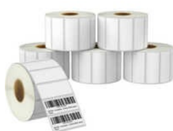
Plain Barcode Labels