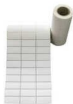
Paper Barcode Plain Label