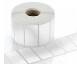
Polyester Barcode Label