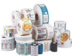
Pre Printed Label