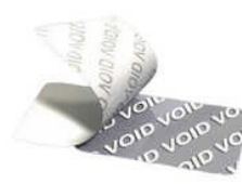
PVC Void Labels Sticker