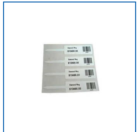
JEWELLERY PRINTED LABELS