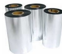
White Wax Resin Ribbon