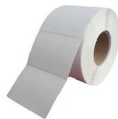
Direct Thermal Barcode Label