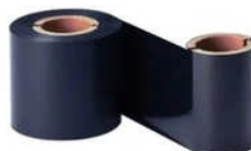
Wash Care Barcode Ribbons