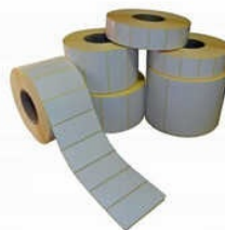
Direct Thermal Label