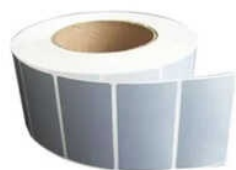
Silver Polyester Barcode Label