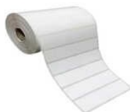
Adhesive Barcode Labels