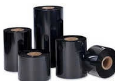
Black Wax Thermal Transfer Ribbons