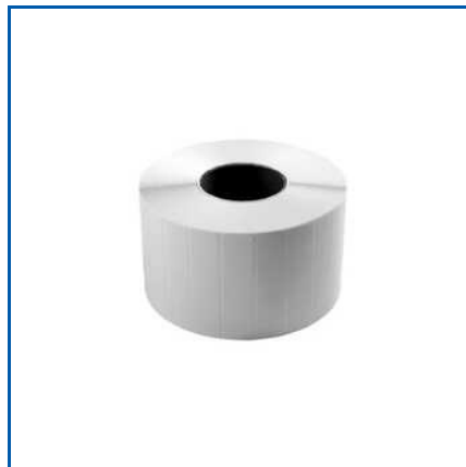
SELF ADHESIVE BARCODE LABEL