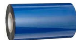
Wax Resin Barcode Ribbon