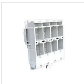
Four Pole Box