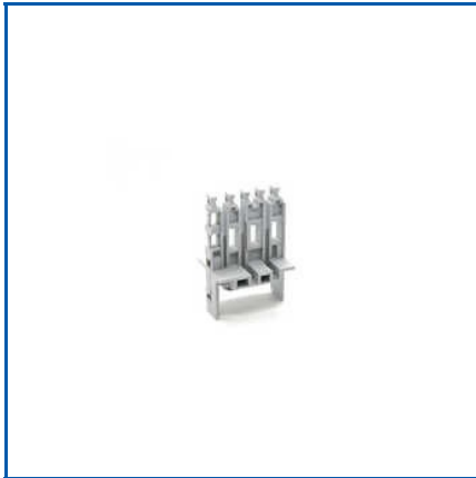
ELECTRIC CONTACT CARRIERS