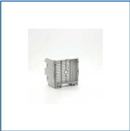
ELECTRIC ARC CHAMBER

Electric Arc Chamber, Electric Contact Carriers, Electric Operating Mechanism, FRP Metro Coach Handles, Four Pole Box, Molded Case Circuit Breaker, Single Pole Box, Transfer Molded Solenoid Coil, Transfer Over Molded Motor Housing, White Plastic Raw Material, etc.