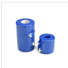
Transfer Molded Solenoid Coil