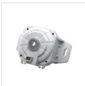
Transfer Over Molded Motor Housing