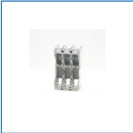
MOLDED CASE CIRCUIT BREAKER