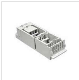
Single Pole Box