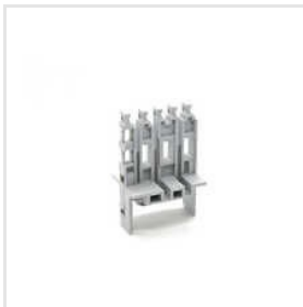
Electric Contact Carriers