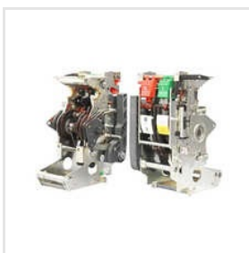
Electric Operating Mechanism