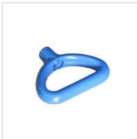
FRP Metro Coach Handles