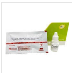
Hepatitis B Rapid Test Kit