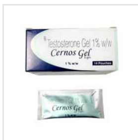
1 Percent Gel