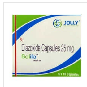
25mg Diazoxide Capsules