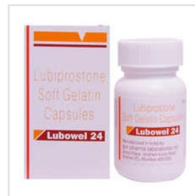
Lubiprostone Soft Gelatin Capsules