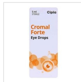
Sodium Cromoglycate (4% W/V) Eye Drops