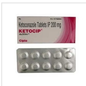
200mg Ketoconazole Tablets