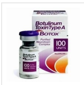
Onabotulinum Toxina Injection