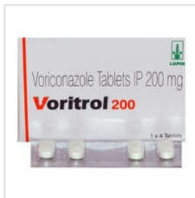
200mg Voriconazole Tablets IP