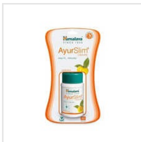
Himalaya Wellness AyurSlim Capsules