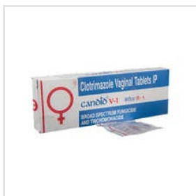
Clotrimazole Vaginal Tablets IP