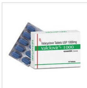
1000mg Valacyclovir Tablets USP