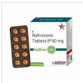
50mg Naltrexone Tablets IP