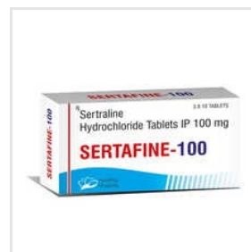
100mg Sertraline Hydrochloride Tablets