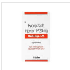
20mg Rabeprazole Injection IP