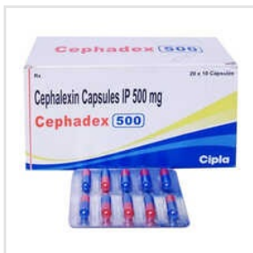
500mg Cephalexin Capsules IP