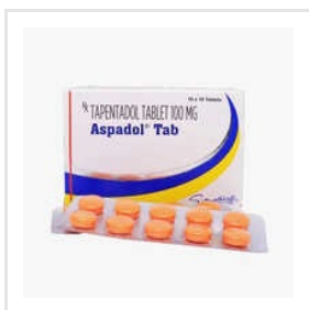
100mg Tapentadol Tablets