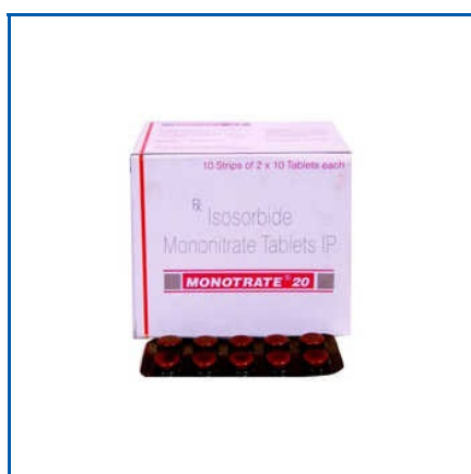
ISOSORBIDE MONONITRATE TABLETS IP

0.5mg Colchicine Tablets IP, 1 Percent Gel, 1000mg Valacyclovir Tablets USP, 100mg Azacitidine For Injection, 100mg Clomifene Tablets IP, 100mg Sertraline Hydrochloride Tablets, 100mg Tapentadol Tablets, 10mg & 5mg Donepezil Hydrochloride Tablets IP, 10mg Prednisolone Dispersible Tablets, 12.5mg Tianeptine Sodium Tablets, 125mg Palbociclid Capsules, 1mg Finasteride Tablets Ip, 1mg Sirolimus Tablets, 200mg Ketoconazole Tablets, 200mg Metronidazole Tablets IP, etc.