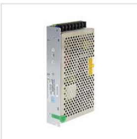
125W Panel Mount AC-DC Switching Power