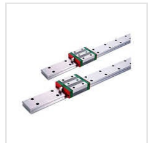
WE Series Ball Type Linear Motion Guide