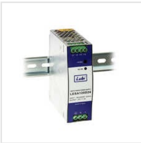
120W DIN-Rail Mount AC-DC Switching