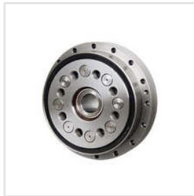
CORONEX ER-P Series High Precision Series