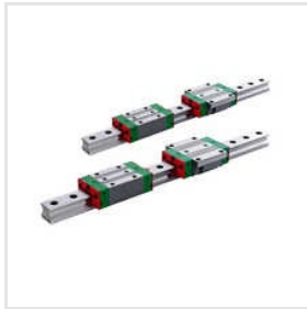
RG Series Roller Type Linear Motion Guide