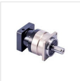
WVRB Series Planetary Servo Gear Box