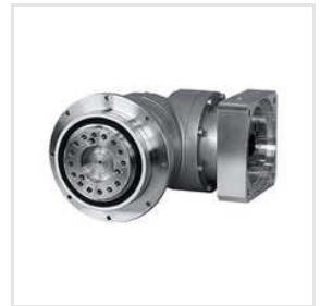
EVT Series Right Angle Planetary Gearbox