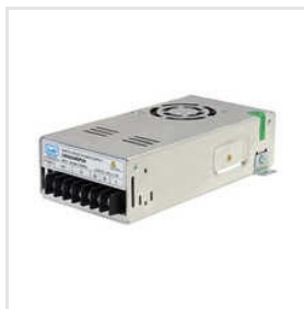
240W Panel Mount AC-DC Switching Power