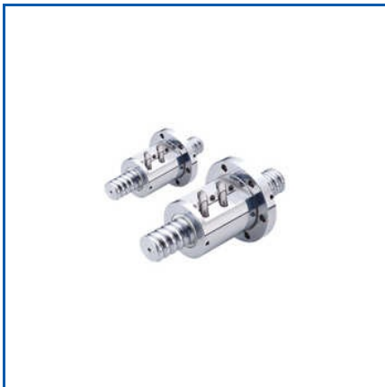
ROLLED BALL SCREW

100W Panel Mount AC-DC Switching Power Supply, 120W DIN-Rail Mount AC-DC Switching Power Supply, 120W Display Function DIN-Rail Mount AC-DC Switching Power Supply, 120W Smart Programmable DIN-Rail Mount AC-DC Switching Power Supply, 125W Panel Mount AC-DC Switching Power Supply, 150W DIN-Rail Mount AC-DC Switching Power Supply, 150W Panel Mount AC-DC Switching Power Supply, 15W Panel Mount AC-DC Switching Power Supply, 240W DIN-Rail Mount AC-DC Switching Power Supply, 240W Panel Mount AC-DC Switching Power Supply, 25W Panel Mount AC-DC Switching Power Supply, etc.