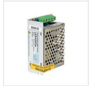
15W Panel Mount AC-DC Switching Power