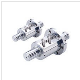
Rolled Ball Screw