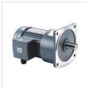
GV Series Geared Motor