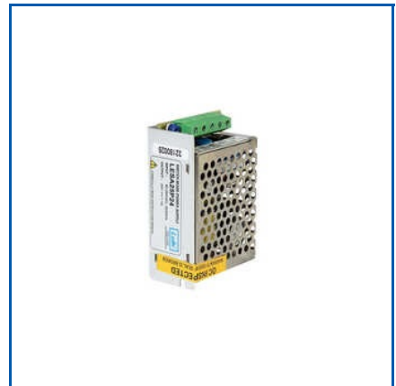
25W PANEL MOUNT AC-DC SWITCHING POWER SUPPLY