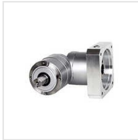
EVL Series Right Angle Planetary Gearbox