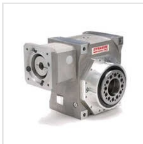
Dynabox Right Angle Planetary Gearbox