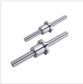
Ground Ball Screw