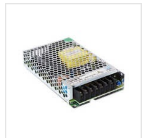
150W DIN-Rail Mount AC-DC Switching