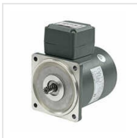
Variable Speed Brake Motor